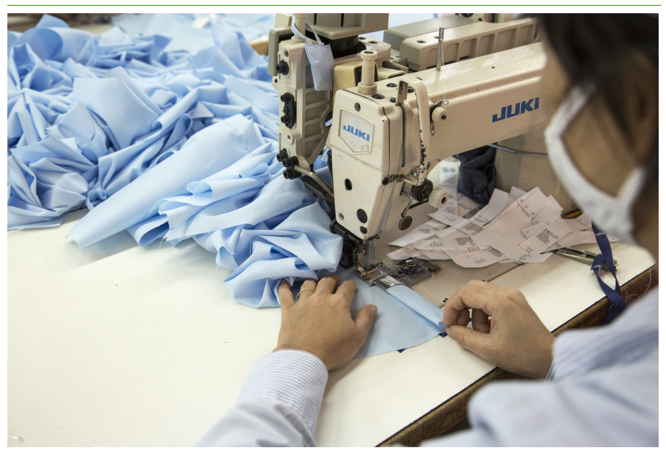
A worker at a garment factory in Vietnam. Oxfam interviewed women and men who work at a garment factory in Vietnam 12 hours a day, six days a week. Despite their long hours, low pay means they still struggle to get by, all while producing clothes for some of the world's biggest fashion brands.