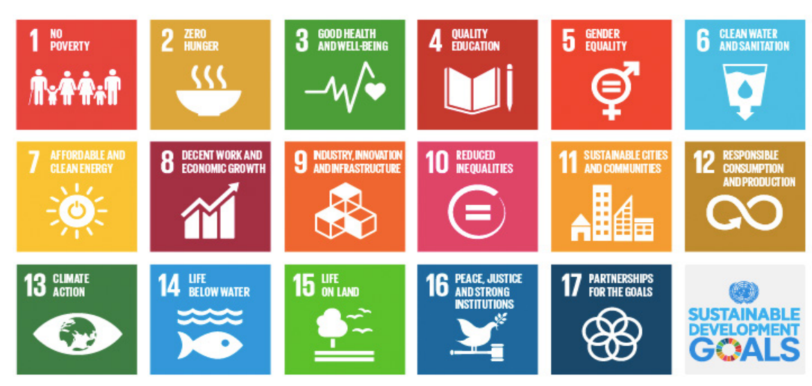
Figure 1: The Sustainable Development Goals