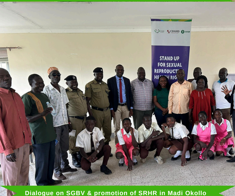
Dialogue on SGBV & promotion of SRHR in Madi Okollo