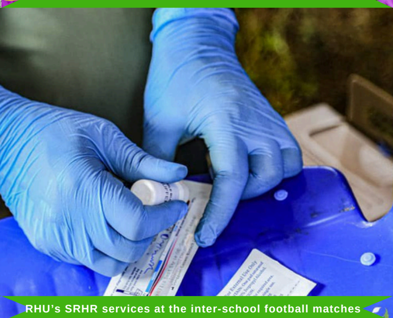
RHU's SRHR services at the inter-school football matches