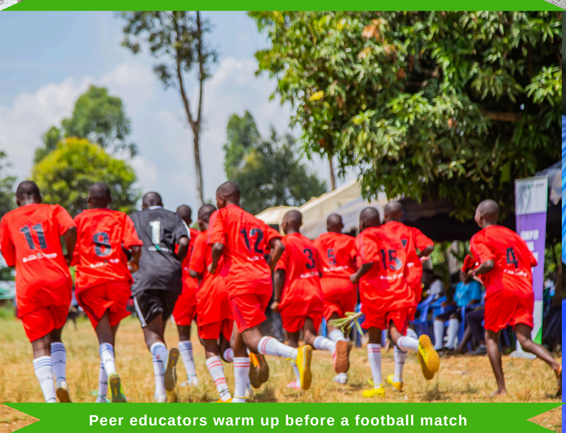
Peer educators warm up before a football match