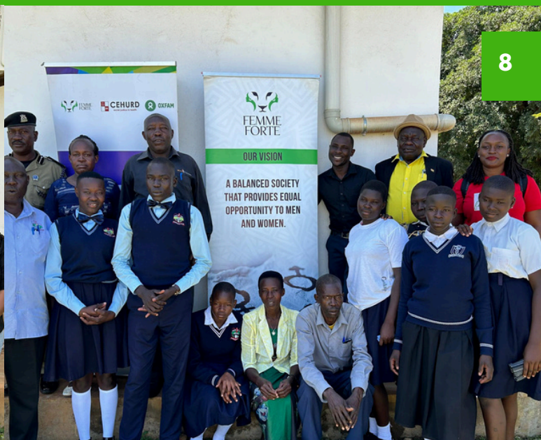
Dialogue on SGBV & promotion of SRHR in Nebbi