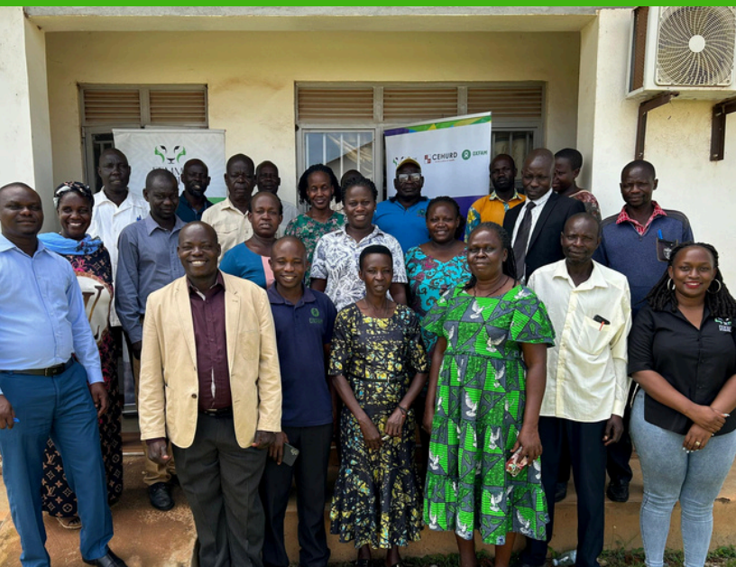
Meeting with education officials in Nebbi