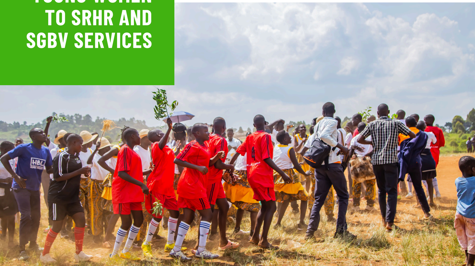
Peer educators and community members participate in a dance interlude at the football matches held in Nebbi District

Femme Forte linked 211 pupils (69 young girls & 142 boys) to SRHR and SGBV services, through inter-school football competitions that attracted 20 schools (300 peer educators and change agents in total) in Eastern Uganda and West Nile. The health services were provided in partnership with Reproductive Health Uganda (RHU) throughout the matches, and we had interludes inform of music, dance, and drama activities that were geared towards creating awareness on SRHR issues among the students and the community present. Watch the mini-documentary: https://www.youtube.com/watch?v=YmAjEBB4rrE