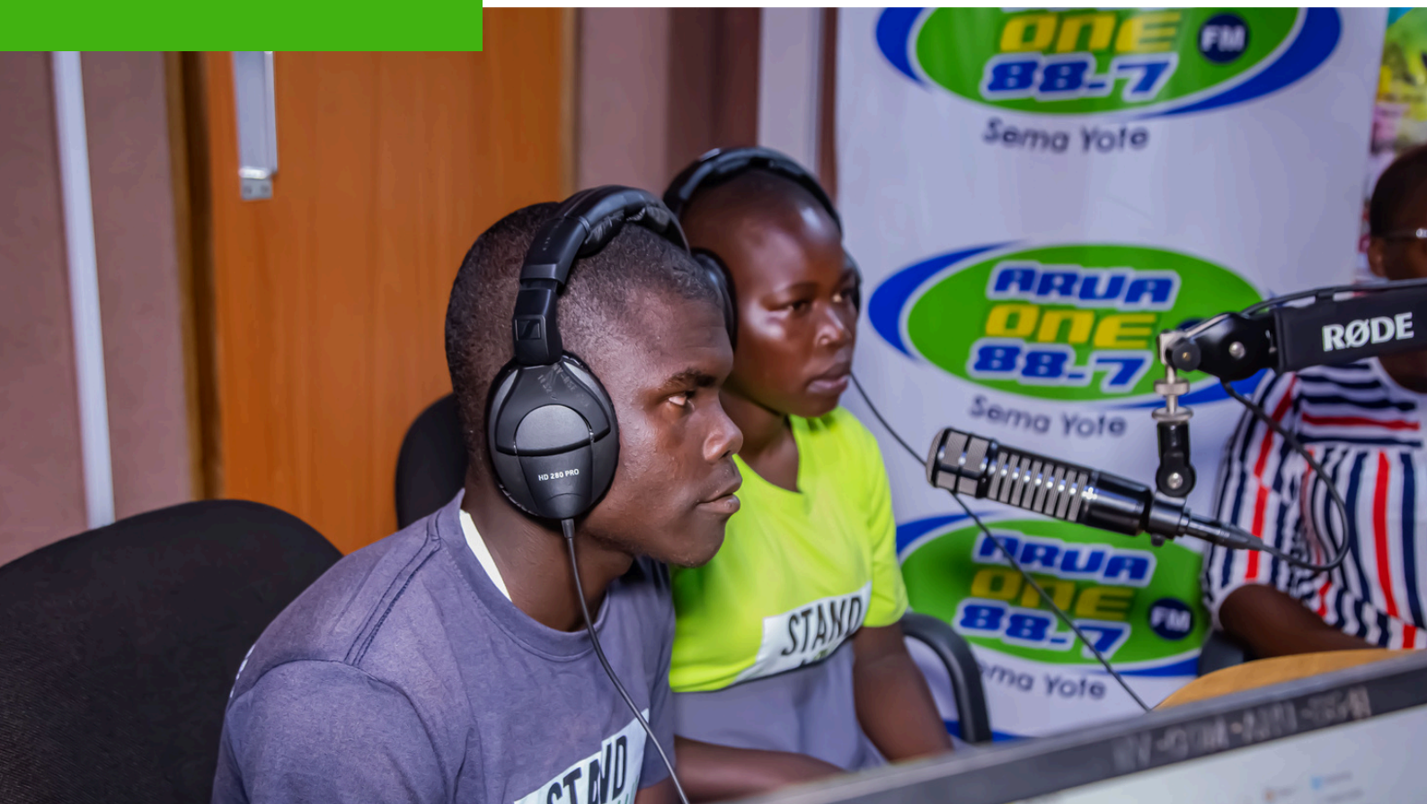
Peer educators of St. Michael Odramacaku live on Arua One FM, discussing the impact of the Stand Up project on their school and community

The shows were hosted in English, Alur and Lugbara, and featured young people that serve as peer educators in the Femme Forte Health Club at school and also community leaders whose work focuses mainly on SGBV prevention and SRHR promotion.