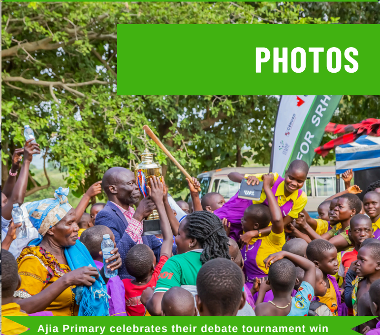
Ajia Primary celebrates their debate tournament win