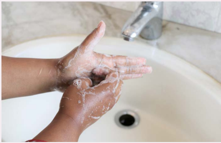
❹ Rub fingertips of right hand on left palm