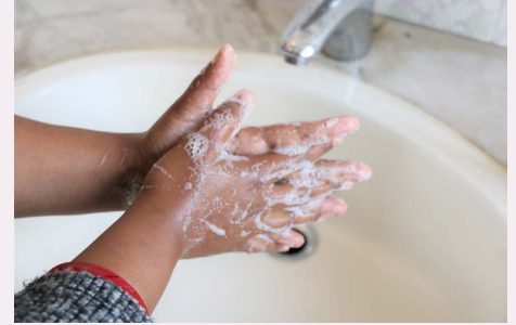
❸ Interface the palms and fingers and rub the hands together