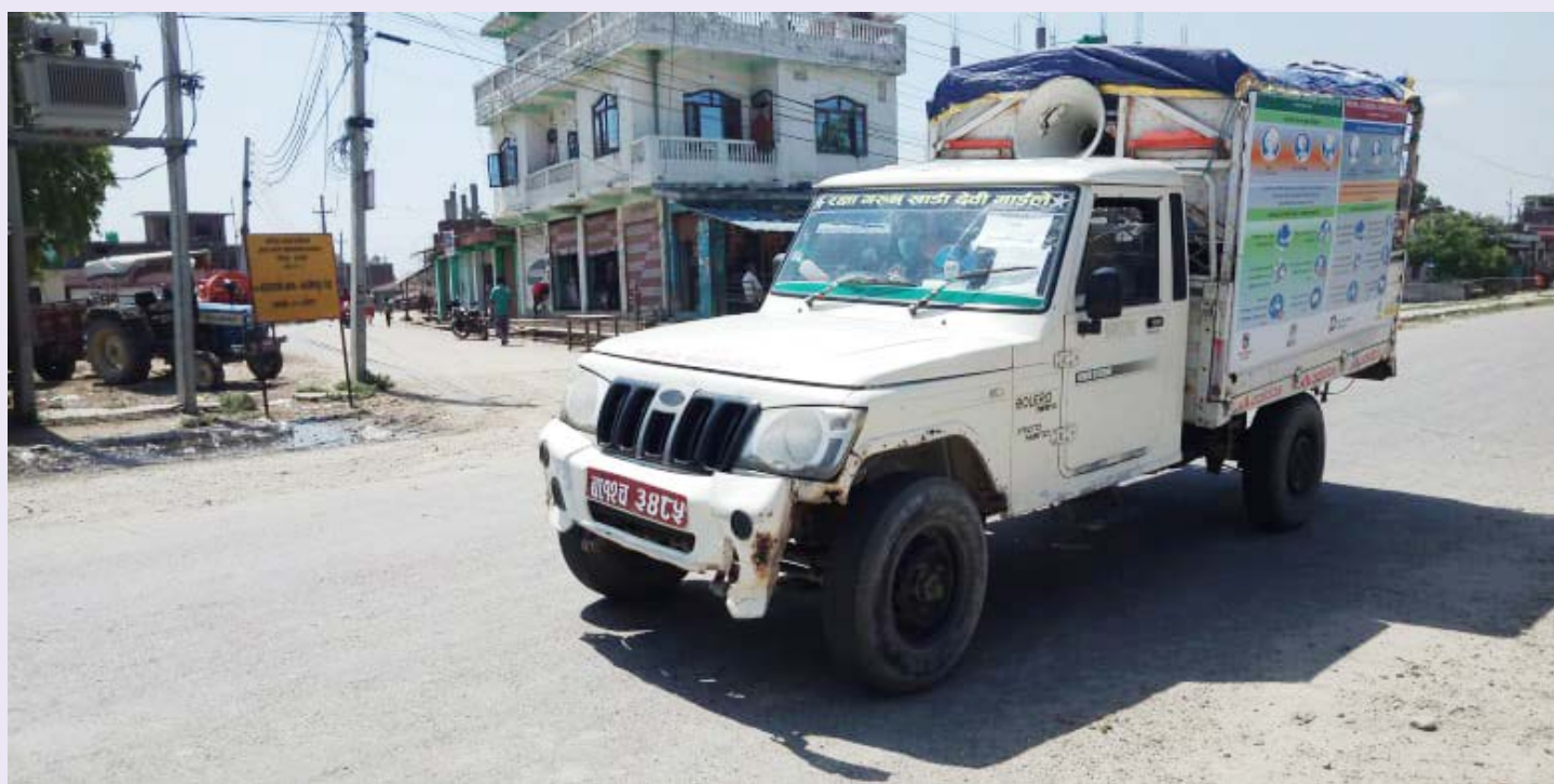
Mobile vehicle playing the Public Service Announcement on COVID-19 preventive measures and symptoms.

Renovations of existing toilets and bathrooms in quarantine center was also carried out. Information dissemination through Radio, Television, mobile vehicle is ongoing. Oxfam in collaboration with local partners also supported in establishment of health desks at quarantines to provide information to people staying in center as well as for community members. It was also ensured that quarantines have properly maintained Water, Sanitation and Hygiene facilities with supply of water.