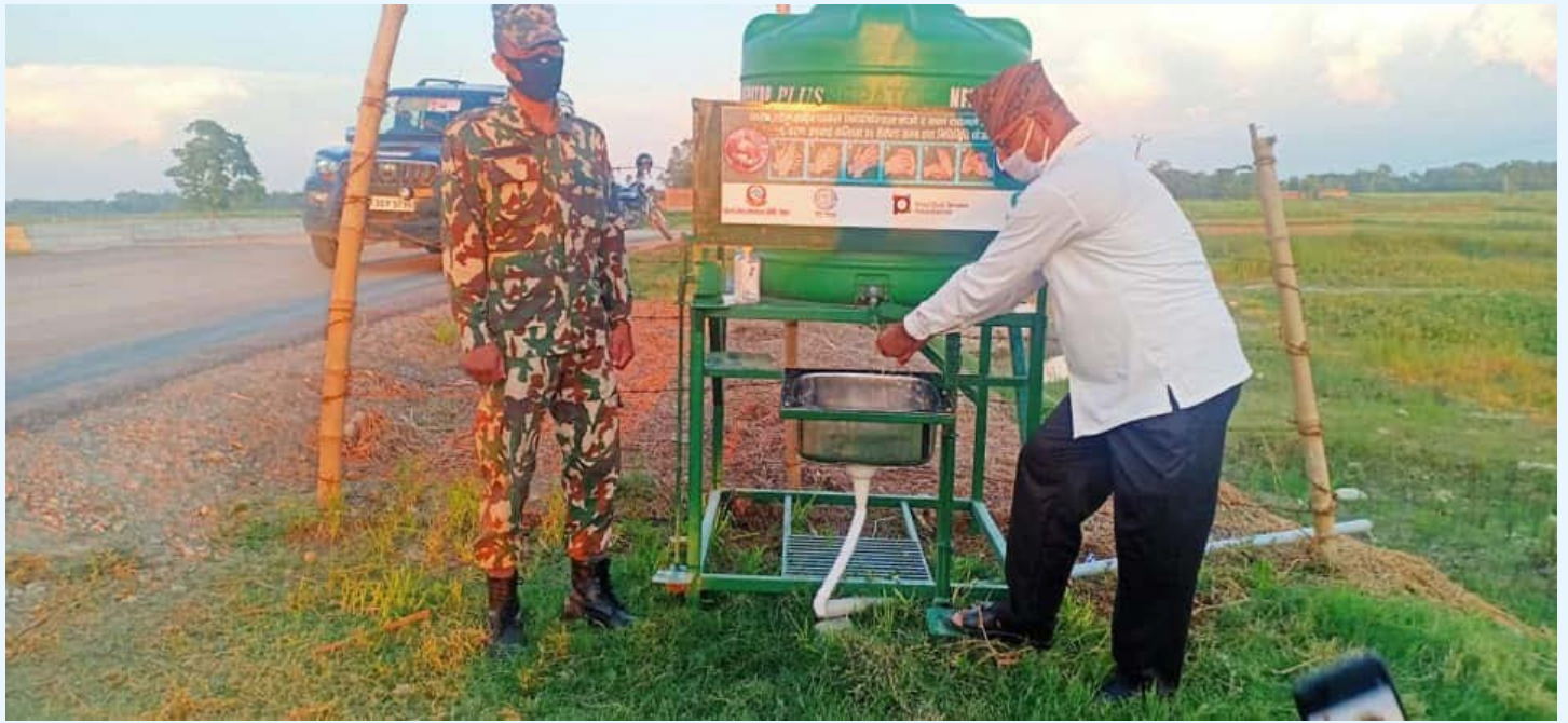
Handwashing station established in the entry ports in Nepal-India border for pedestrians.