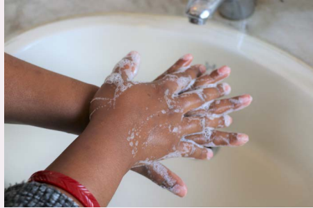
❷ Rub the back of both hands