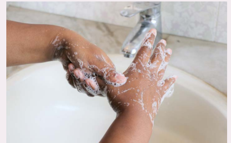
❻ Rub thumb in a rotating manner followed by the area between index finger and thumb.