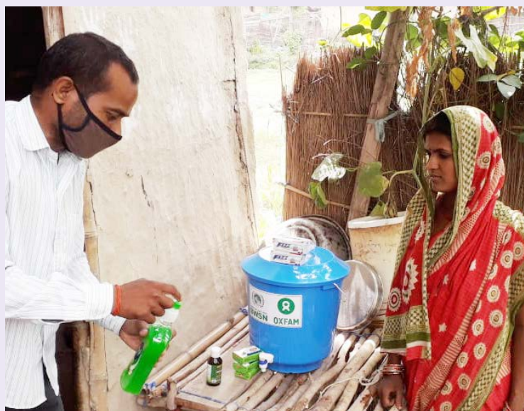
A representative from partner organization showing the liquid to use while hand washing.

Under the Poul Due Jensen (PDJ) Foundation supported project Emergency Hygiene Promotional Intervention for Improving Public Health against COVID-19, Oxfam with support from local partners Rural Development Center Nepal (RDC) and Bagmati Welfare Society Nepal (BWSN) has been carrying out the COVID-19 response activities since the start of its impact. Distribution of Personal Protective Equipment such as gloves, PPE sets, Infrared thermometers, KN95 masks, surgical masks and hygiene and sanitation related items such as hand liquids, soaps, waste bins, disinfectant phenyl, disposal caps were distributed along with general protective products such as, mosquito nets, slippers, trays, bedsheets, tents, to the communities of Rautahat and Sarlahi.