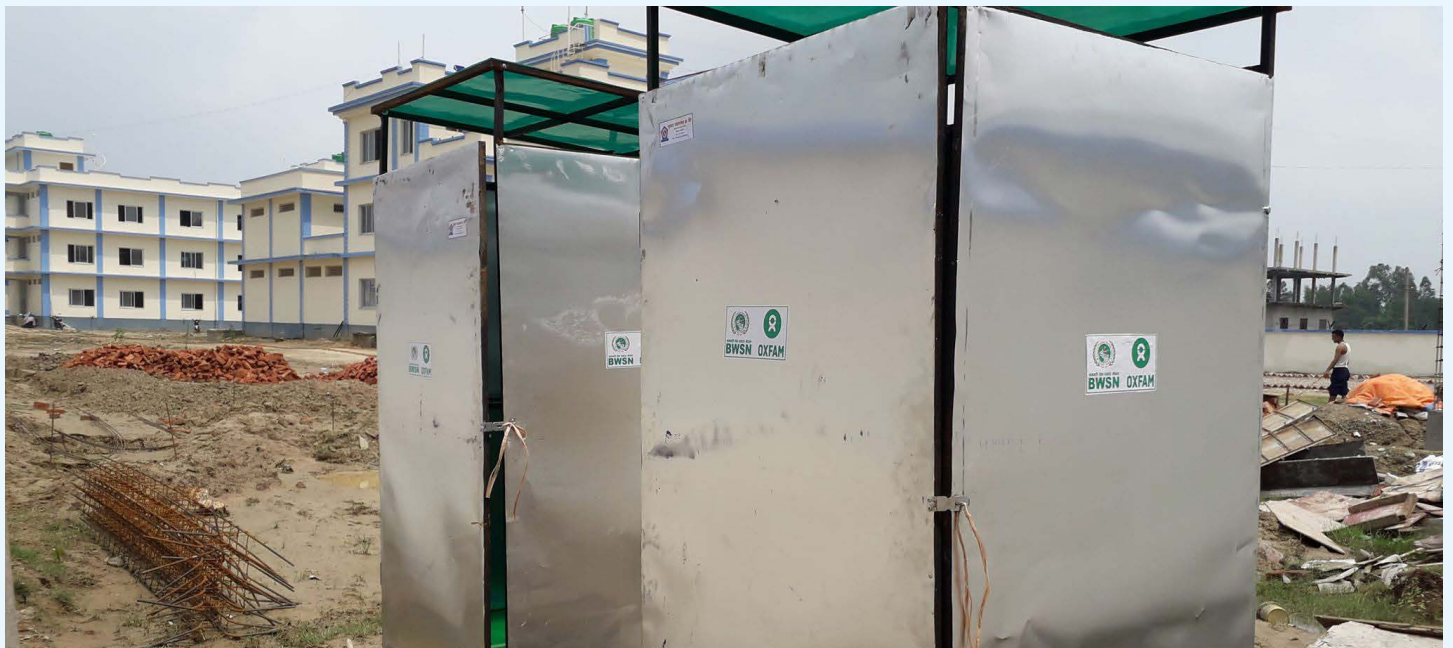
Construction of toilets and bathing facilities.

Three pedal operated hand washing stations in entry port of Sarlahi and one in Rautahat was installed with regular supply of water to facilitate and support with hand washing practices of the people entering the country from India.