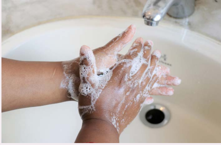
❶ Rub palms together