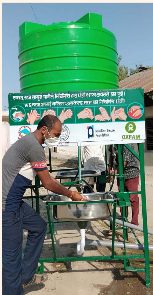
A community member washing his hands in a newly installed hand washing station.

Oxfam in Nepal in coordination with local partners and stakeholders have installed 35 pedal operated handwashing stations in different quarantine centers, isolation centers, government offices and health care facilities. In Sarlahi, 23 of such handwashing stations has been established, whereas, in Rautahat, there are 32 handwashing stations. These stations have been established with regular supply of water, hand washing liquids and sanitizers (for three months) to respond for preparedness against possible outbreak of COVID-19.