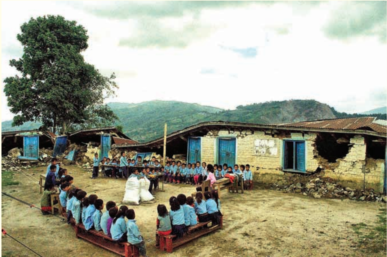
Figure 9: Children gather around in the open field of a damaged school in Sindhupalchowk

The case studies and consultations were made in Nuwakot, Rasuwa and Dolakha districts to explore the current situation of survivors of Nepal 2015 earthquake.