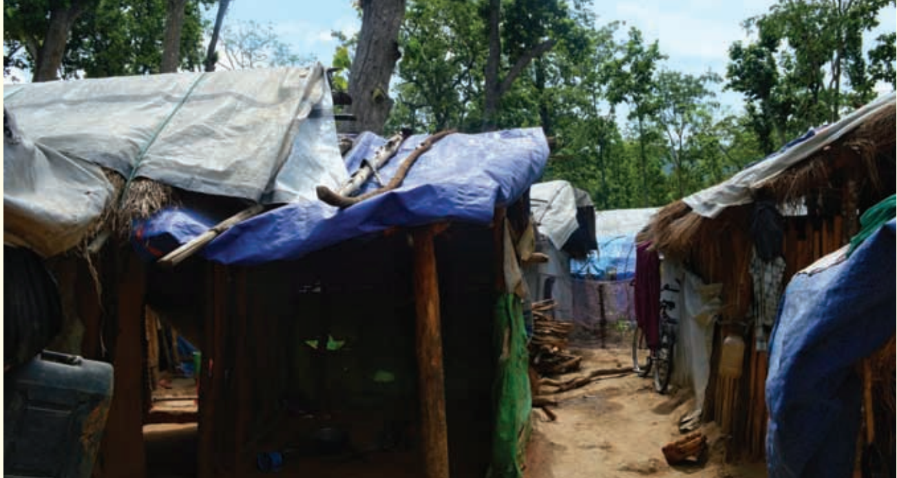
Figure 1: Shelter of flood affected community in Girighat, Surkhet

Girighat temporary shelter camp lies beside the highway in a community forest in Hariharpur VDC, Surkhet. Approximately, 174 families relocated mostly from ward no 1,3,4,5,9 are residing in the camp after their village got flooded in 2014. Government has decided to provide NPR. 50,000 per family to buy land and additional NPR. 75,000 to rebuild home. They think that the allocated money is not enough, either to buy a land or to build a new house.