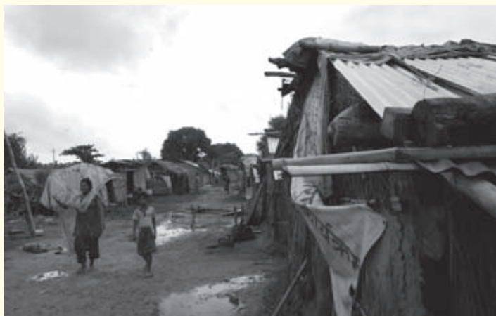
Figure 4: Shelter of flood affected families in Gulariya, Bardiya

“There’s no one left in my family, so I can’t go back to the original community as it reminds me of everything. I don’t have any land, home or sense of safety and security. I don’t need money; I just want government to provide me a land in a safe space to live” she demanded.