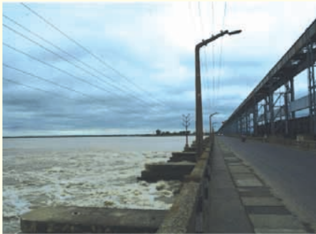
Figure 6: Koshi Barrage