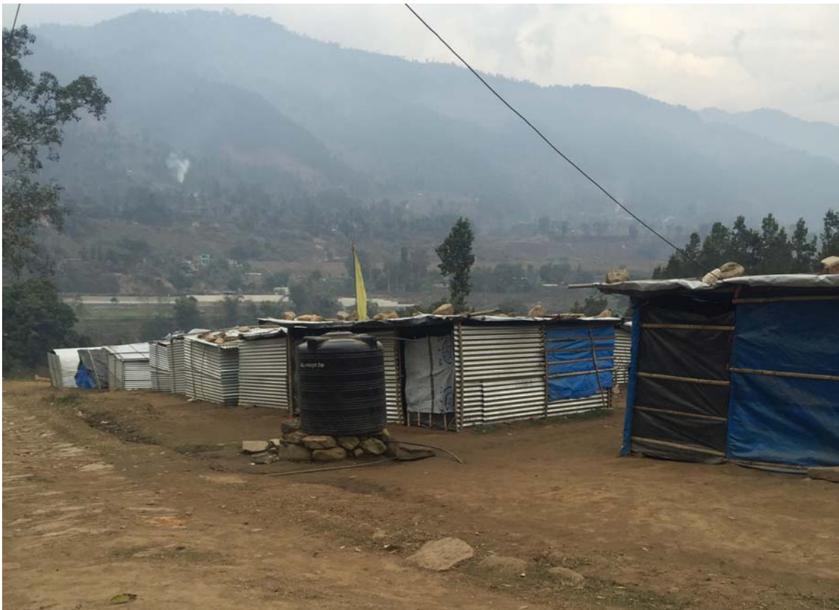
Bidur IDP camp, Nuwakot, Nepal, January 2016.

For some communities, resettlement will be necessary if they are on hazard prone (unsafe) land. Communities that we spoke to welcome resettlement if their land is deemed unsafe. Resettlement sites, however, should not be too far from their original community so that people can access their agricultural land, or if this is not possible, new agricultural land should be provided alongside the land for housing, and all necessary facilities supplied. Resettlement needs to be community led with free, informed and prior consent.