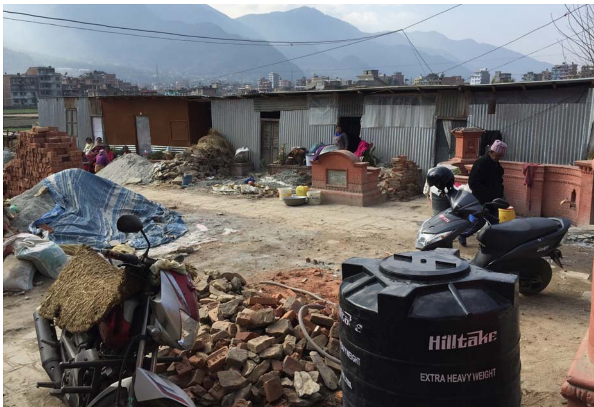
Temporary shelters in Kirtipur, Nepal, January 2016.

There are two government land allocation programmes for the resettlement of landless households: the Free Kamaiya (bonded labour) and Free Haliya (agricultural workers) programmes. The Free Kamaiya programme has provided plots of land to around 26,000 formerly bonded labour households identified as landless. 14 A further 10 percent of eligible households have received cash assistance to purchase land, where government land is not available.