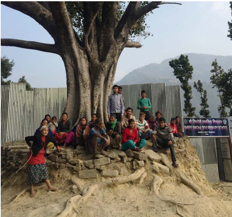
Focus group under a tree in front of temporary school in Kadambas, Sindhpalchowk, January 2016.

The CLR project aims to develop community-led byelaws to manage community land and other natural resources. It is based on the principle of participatory law making, involving the community itself alongside partnerships with local authorities and political parties. Its aim is to find participatory solutions to problems relating to land—including forestry and water resources—and agricultural reform.