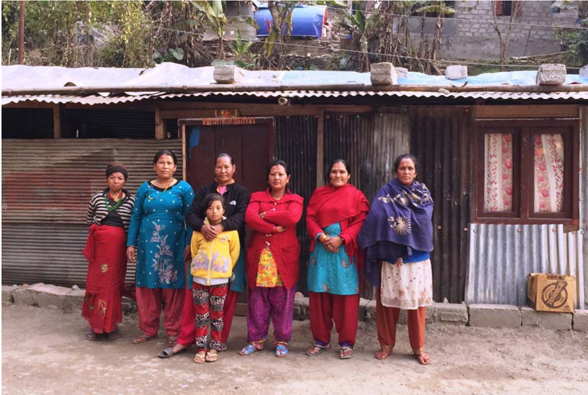
Women outside temporary shelters on NEA land, Pangretar, Sindhupalchowk, Nepal, January 2016.

While other examples emerged through the research, the case in Box 3 was the most stark demonstration of how marginalized some groups can become and how even the authorities fail to recognize their rights. Local political representatives in Nuwakot mentioned another case: