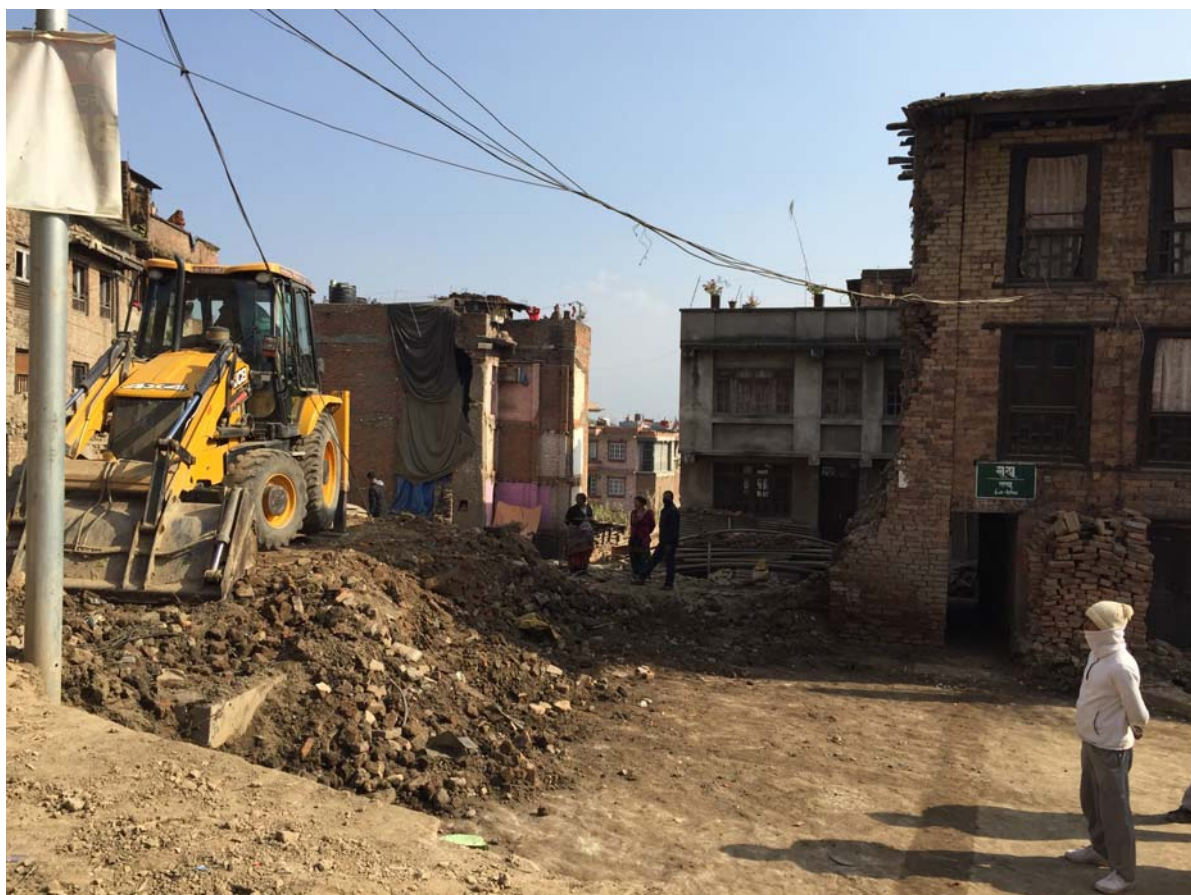
Clearing rubble in Kirtipur, Nepal, January 2016.

resettlement decisions. Initial consultations with affected communities were undertaken and are crucial to ensuring recovery meets their needs. To ensure that it properly represents women's needs, women's groups should be included in the consultation of the draft, and all actors should have sufficient time to properly input into the draft document.