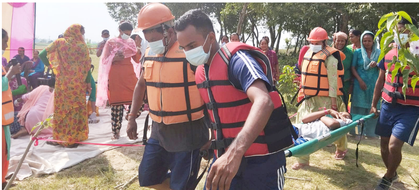
Emergency Preparedness Training conducted by NEEDS with Oxfam's support.

Riverine communities of Mahakali River face acute problems of floods and landslides during monsoon season. The dynamically changing scenario of disasters and the unprecedented magnitude and impacts to communities pose a major challenge.