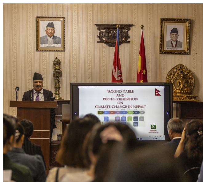
His Excellency Bishnu Pukar Shrestha, Nepal's Ambassador to China speaking at "Roundtable and Photo Exhibition on Climate Change in Nepal" event organized by Embassy of Nepal in Beijing in collaboration with Oxfam.

Oxfam's target for influencing work on climate action encompasses local government bodies, provincial government authorities, federal government agencies, as well as international stakeholders. With this comprehensive approach we aim to maximize impact and promote climate-resilient development across various levels of governance and international cooperation and advocate for climate change financing including loss and damage.