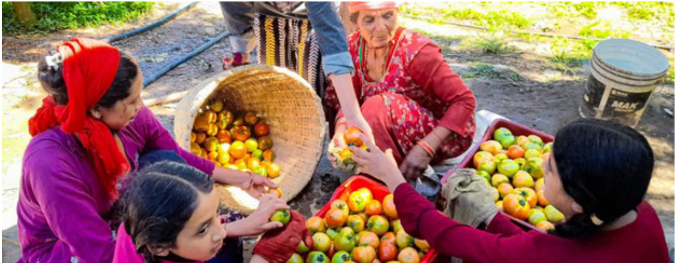
Women sorting and grading vegetables in Jukepani.

Jukepani, a village in Patan Municipality, Baitadi District of Sudurpaschim Province is in recent times covered with green vegetables. However, not too long ago, majority of youth from the village would go to India for employment. Since the past three years, villagers are making a good income through commercial vegetable farming.