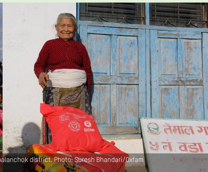
Winterization set distribution at Temal-1 and Temal-5 in Kavrepalanchok district.