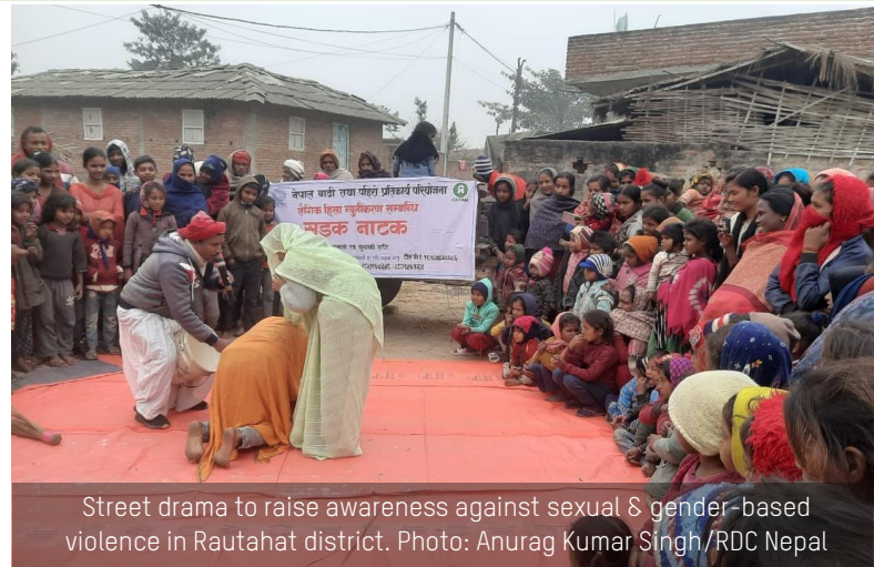
Street drama to raise awareness against sexual & gender-based violence in Rautahat district.

Supported for repair and maintenance of 11 water supply schemes in Benignat Rorang Rural Municipality and 10 water supply schemes in Jwalamukhi Rural Municipality of Dhading district.