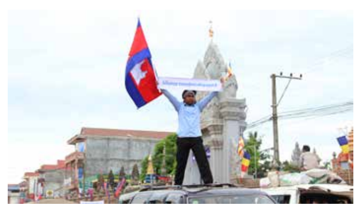
Picture 2: Active citizen participated in a campaign against corruption

People report that today there is greater discussion of political issues in markets and other public places, reflected in the increase in radio callers on some programs. Youth, who have benefitted from recent increases in affordable internet and Khmer language capabilities on popular sites becoming increasingly active, with the majority being women.<sup>39</sup> Facebook with 740,000 Cambodia users in 2011, 50% of whom were identified as between 18-24