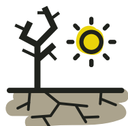
NEGATIVE IMPACTS FROM AND CONTRIBUTION TO CLIMATE CHANGE

Based on the recognition that financial viability and gender equality and sustainable supply chains are not mutually exclusive, GRAISEA aims to promote win-win-win partnerships between communities, small-scale producers and larger businesses.