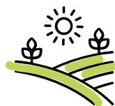
INADEQUATE UPTAKE OF RESPONSIBLE AGRIBUSINESS PRACTICES