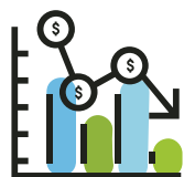
DECREASING RETURNS FOR SMALL-SCALE PRODUCERS

Among others, the rice sector is facing a range of social, environmental, and economic issues that include: