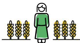
MARGINALIZATION OF WOMEN IN THE RICE VALUE CHAIN