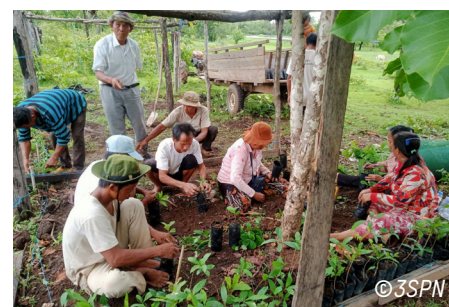
Tree nursery preparation for flooded forest plantation/restoration in Boeung Chres Consevation Area, Ratanakiri province.