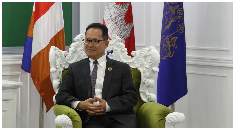
H.E. Sophalleth Eang, Minister of the Ministry of Environment.

Minister Sophalleth Eang welcomed Ireland's increasing focus in Cambodia. He highlighted his Ministry's Strategy on Environment 2023 – 2028 aiming to ensure sustainability, promote a green economy and respond to climate change. He said "The Ministry of Environment recognises that environmental issues have no borders and require global cooperation. We welcome all development partners who intend to join in the implementation of our Climate Strategy. I express my appreciation for the work that Ireland is doing in Cambodia and look forward to further cooperation."