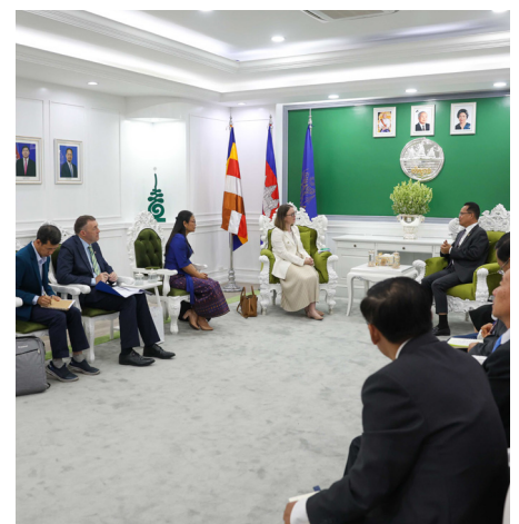
The discussion between Ms. Deirdre Ní Fhallúin, the Ambassador of Ireland to Cambodia and H.E. Sophalleth Eang, Minister of the Ministry of Environment.

on community involvement and education. By providing training and resources, the programme ensures that local communities are equipped with the knowledge and tools needed to adapt to changing climatic conditions. This grassroots approach fosters resilience from within, creating a sustainable model for climate adaptation. Ireland's support for Cambodia is a powerful example of international cooperation and shared responsibility in addressing global climate change challenges.