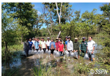
Awareness campaign and releasing fingerlings in Serey Monkul Trapaing Chres CFi, Ratanakiri province.

The officials emphasized the importance of co-management and community participation in sustainable fisheries stewardship. They praised the initiative's potential to develop community-based ecotourism as a source of sustainable financing for fisheries conservation. This collaborative effort demonstrates a strong commitment to protecting aquatic resources and ecosystems in the Sesan and Srepok rivers, empowering local fishing communities as the custodians of their natural wealth.