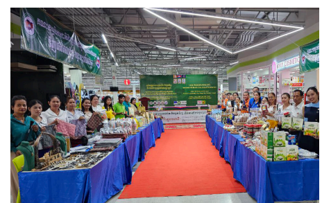
Cambodian local producers showcased their products at Big C Supermarket.

This important project, initiated by OVOP and Oxfam in 2022, aims to support and strengthen market access for local producers. Over the past two years, 17 forums and exhibitions have been held, benefiting approximately 3,000 producers and buyers. This year, we plan to hold the forum in Phnom Penh, and other four provinces including Kampong Thom, Siem Reap, Koh Kong, and Banteay Meanchey.