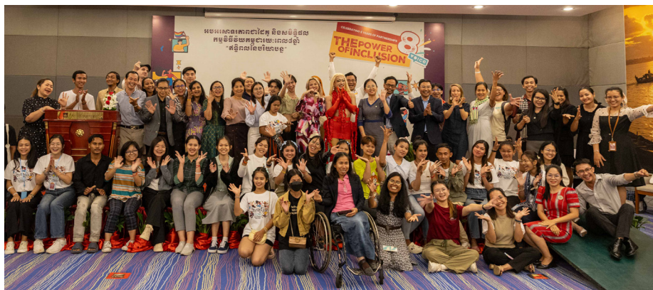
Distinguished guests, and participant gathered for a group photo during The Power of Inclusion festival in Phnom Penh, celebrating eight years of the Voice project’s impact.

Oxfam and our partner Live & Learn Cambodia organized “The Power of Inclusion” festival on April 5, 2024 in