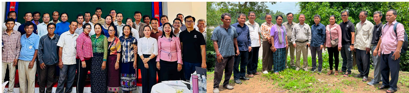
Distinguished guests, and participant gathered for a group photo during Sustainable Financing Training for CFIs and FiA.

Text by: Soknak Por