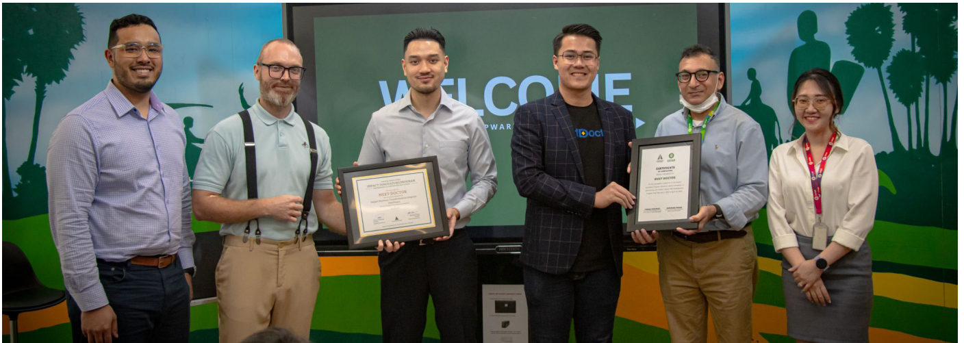
The presentation of certificates of completion to businesses that successfully completed the Impact Innovators Program.

Text by: San Sar