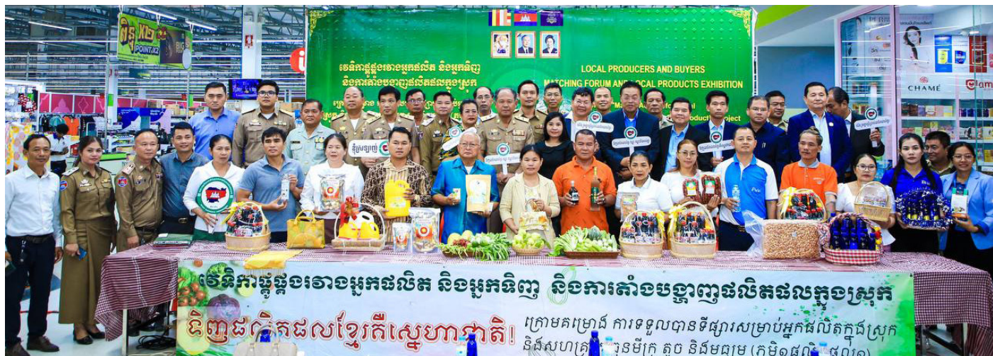
Local producers, traders, and government officials gathered at the Local Producers and Buyers Matching Forum and Exhibition held at Big C Supermarket in Poipet, Banteay Meanchey.

Cambodian SMEs have faced significant market access challenges due to a lack of timely market information and limited networking and partnership opportunities. Improving access to market data and fostering stronger business networks are essential for enhancing their competitiveness and market reach.