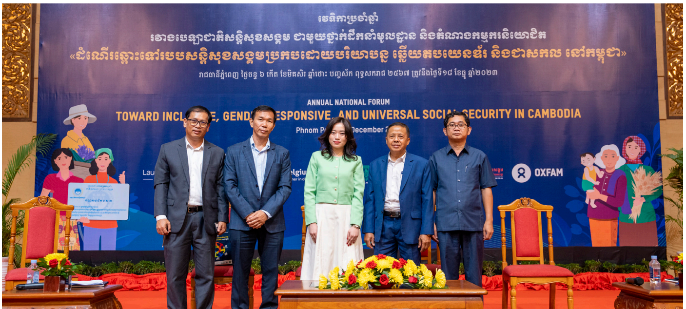
Annual national forum on 'Toward inclusive, gender responsive and universal social protection in Cambodia' in Phnom Penh.

The coalition has been supported by two initiatives: Inclusive National Social Protection Initiatives that Respond to the Needs of Apparel Industry Employees (INSPIRE) funded by the Laudes Foundation. and the Improved Social Protection and Labour Rights for Women Workers in ASEAN's Agri-food Sector (DGD Programme), funded by Belgium's government.