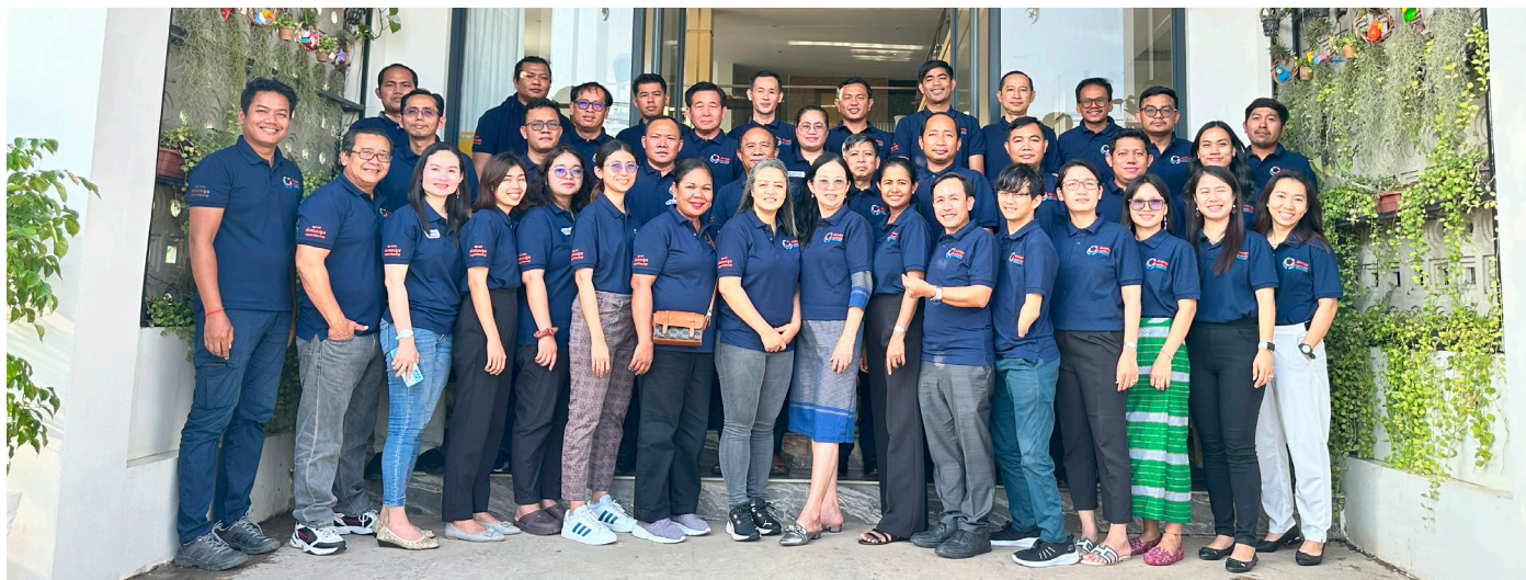
Social Protection for All (SP4All) annual planning at Kampot province.