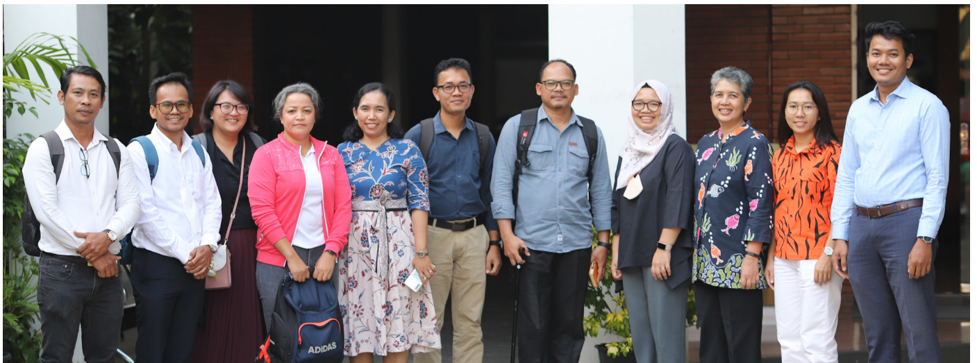
SP4ALL learning visit to Indonesia.