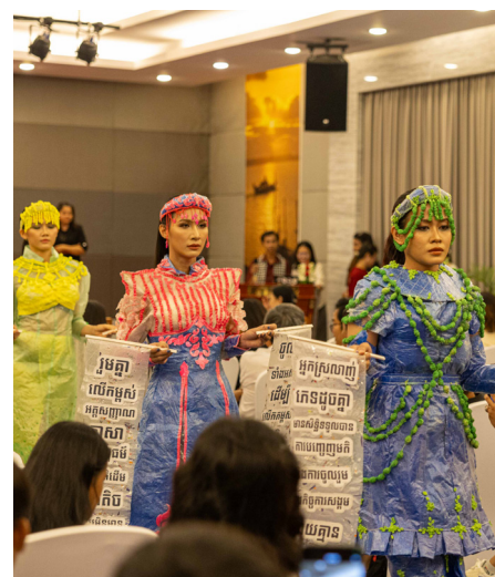
A fashion show highlighting key messages of a rightsholder group.