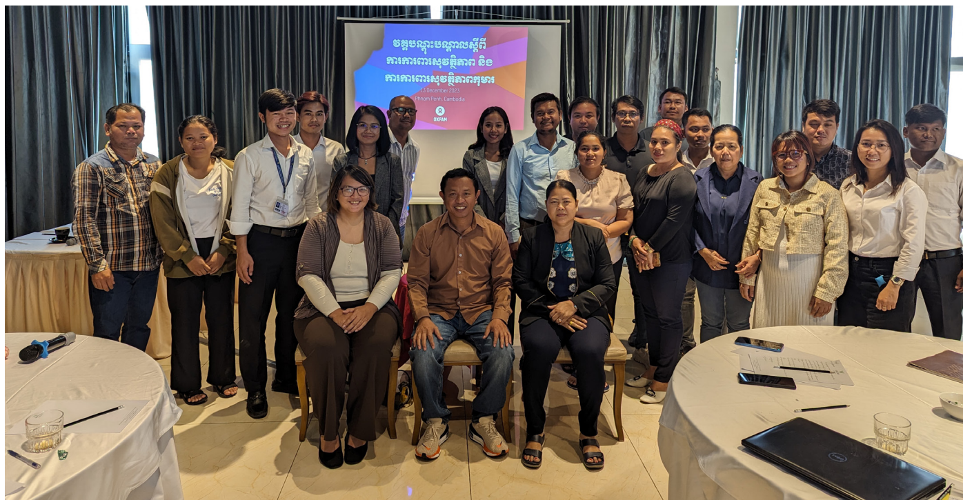
Oxfam conducted a child safeguarding training to the management and staff members of the Coalition of Cambodian Apparel Workers Democratic Unions (C.CAWDU)