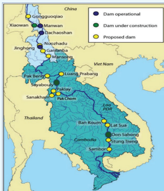
Figure 1. Location of constructed/ planned hydropower projects in the Mekong Basin

economic costs of environmental and social impacts such as capture fisheries loss and reduction in sediment/ nutrients and overestimated the economic benefits from hydropower. By changing and updating some of the economic assumptions and values, we find that the overall economic impact of planned Mekong hydropower projects would be negative.