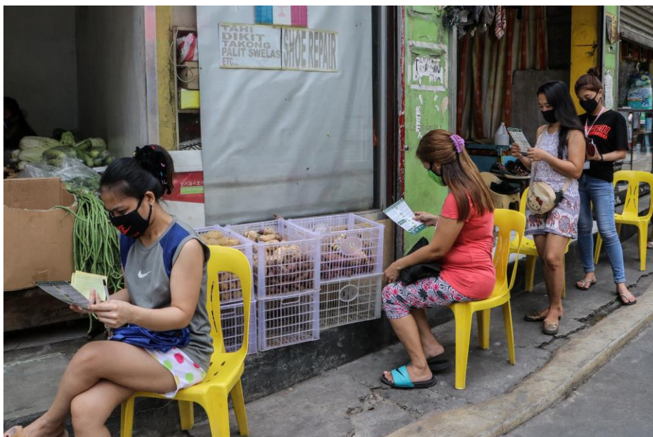
Women from a community in Quezon City, Philippines, line up to enter a market as the local government strictly imposes social distancing in public places. They also received flyers from IDEALS and Oxfam containing relevant information about COVID-19 and essential tips on how to cope with the enhanced community quarantine.