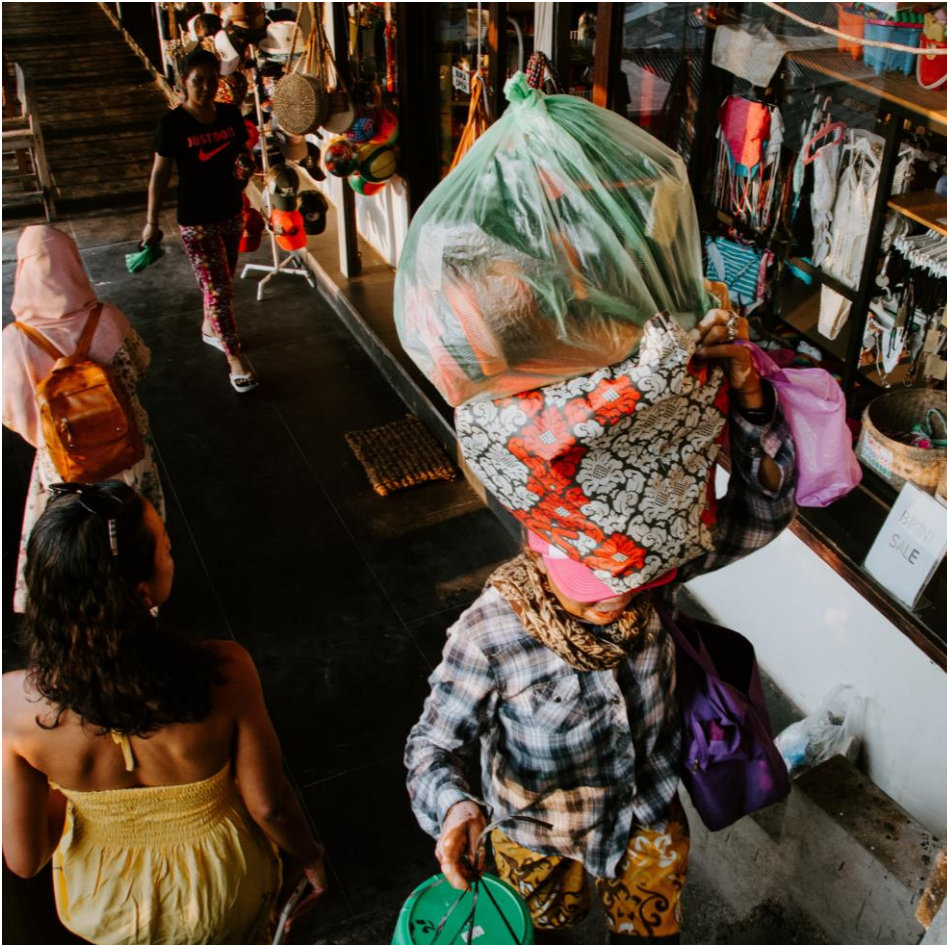
An Indonesian woman selling batik cloth near Suluban Beach in Bali.

These policy actions, implemented in coordination, will contribute to realizing the vision of globally competitive, innovative, inclusive, and resilient MSMEs in 2025 in the ASEAN region.