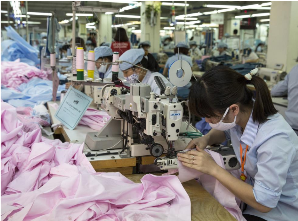
Women factory workers in Vietnam.