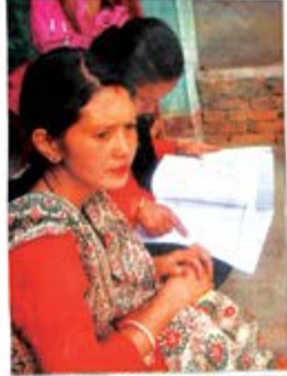
A major offertied woman, who claims to have been excluded for the list of victims, gets her name shocked at the sub-regional offer at the load decrease and the list in the land.

Cameration. There is a high chance that the poperal and the sources triction of line man's certificate man and to able to relocate their bosses to they have best finity documents on have server