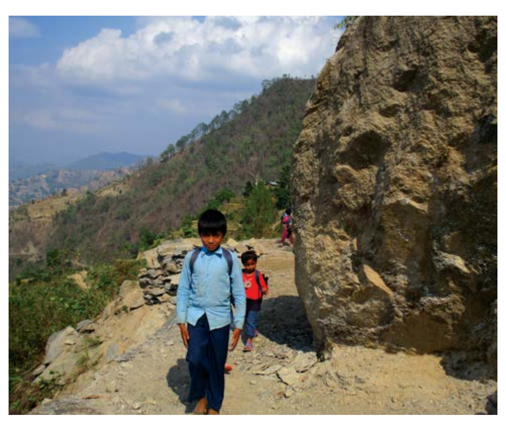
School kids now have a little expanded road.

In order to help people affected by the 2015 earthquake, Oxfam in Nepal with its partners started providing temporary jobs to the people so that they could earn for themselves and at the same time, their community structures would also be built back better.