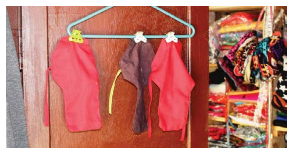
Sajilo Napkins, sewn at Padma's tailoring shop on display for sale.

a very optimistic Padma did not want to waste any time to utilize her newfound skill. She was able to make extra income by sewing the homemade sanitary napkins Sajilo Napkin and selling them. "I usually have a lot of leftover cloths which would be wasted otherwise," Padma says, "But I can now turn these clothes into something useful and sell them at an affordable cost." She sells these napkins at NRs 25 (0.22 USD) per piece.