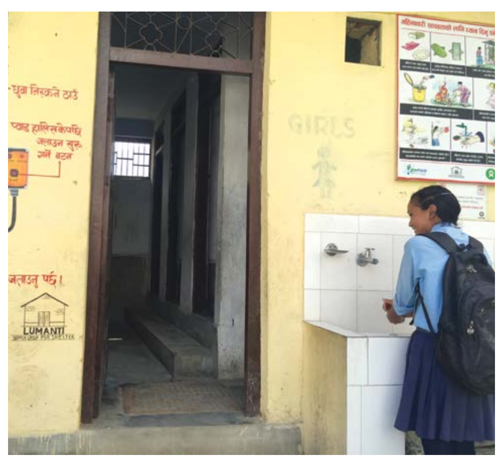
Toilets are now girl friendly with installation of pad incinerators.