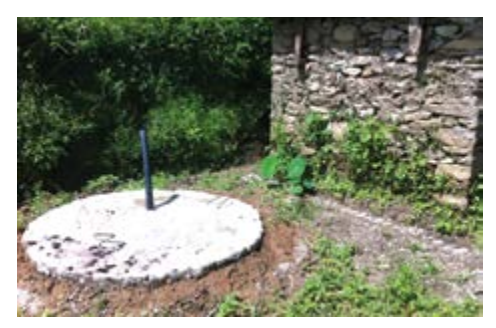
A septic tank built next to Tamang's new toilet.