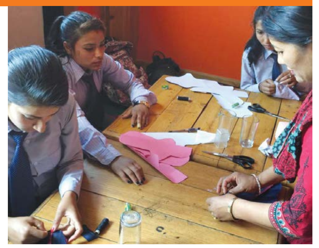
Students getting hands-on training to make sanitary napkins.

"After the earthquake there were no latrines for us in the school. We would be in the same sanitary cloth for the whole day. And if we felt like it was going to stain our skirts, there was no other option than to go back house by wrapping a shawl