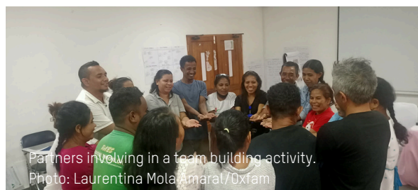
Partners involved in a team building activity.

child protection standards, empowering our partners to create safer, more secure environments for children. We believe that by investing in the capacity-building of our partners,