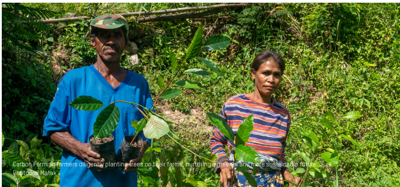
Carbon Farming farmers diligently planting trees on their farms, nurturing a greener and more sustainable future.

Farmers expressed their gratitude and enthusiasm for receiving high-quality trees, eager to plant and nurture them. This initiative not only enhances the well-being of the communities but also contributes to long-term ecological benefits, fostering a greener and more sustainable future for the region.