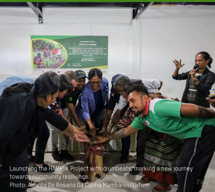
Launching the HAMRIIK Project with drumbeats, marking a new journey towards community resilience.