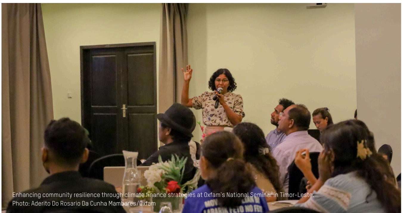
Enhancing community resilience through climate finance strategies at Oxfam's National Seminar in Timor-Leste.

The seminar served as a catalyst for renewed commitment towards sustainable development and climate adaptation in Timor-Leste, advocating for inclusive and participatory approaches to tackle the challenges posed by climate change on local communities.