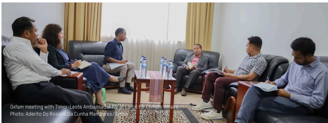
Oxfam meeting with Timor-Leste Ambassador for at Large for Climate Affairs.

Through our gender justice initiatives, we have empowered countless women, providing them with tools and opportunities to lead and thrive. Their resilience and determination have been a source of inspiration. In the face of the climate crisis, our climate justice programs have supported communities in adapting to and mitigating its effects. Together, we've promoted sustainable farming and ensured a greener future for generations to come. Our commitment to just economic development has seen us work towards creating equitable opportunities by supporting women, men, persons with disabilities, and youth, and advocating for fair policies.