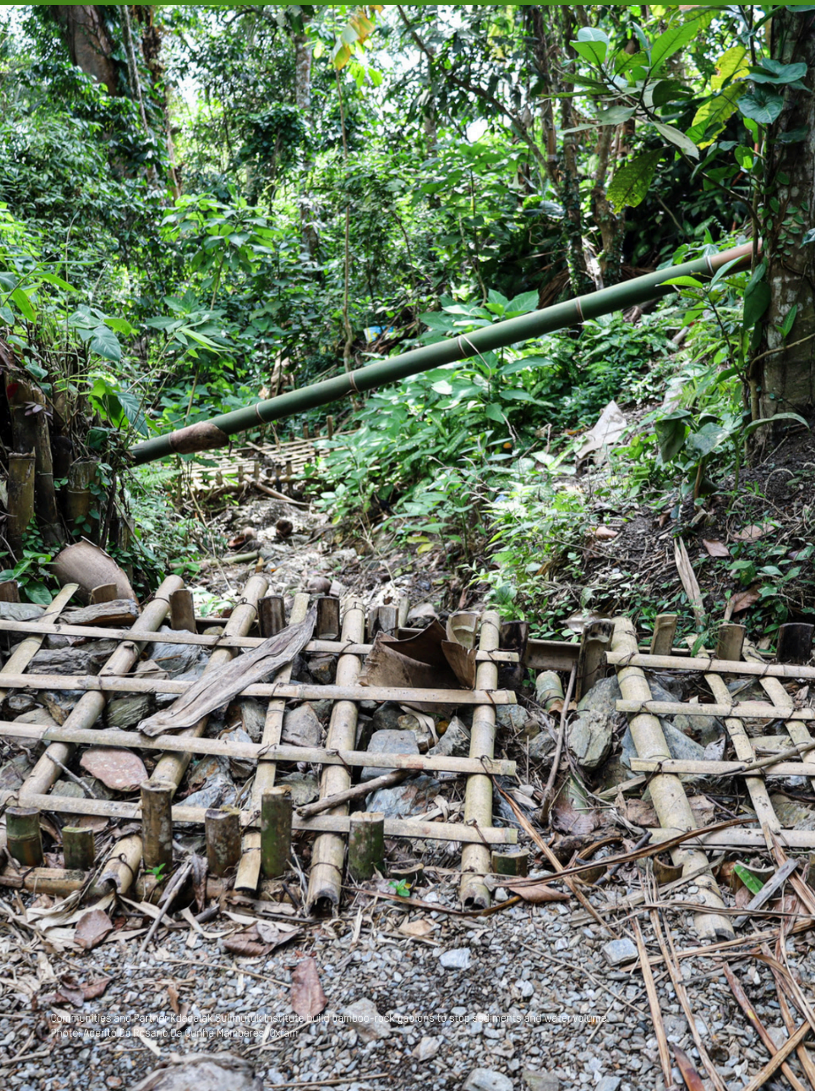
Communities and Partner Kdadalak Sulimuruk Institute build bamboo-rock gabions to stop sediments and water volume.