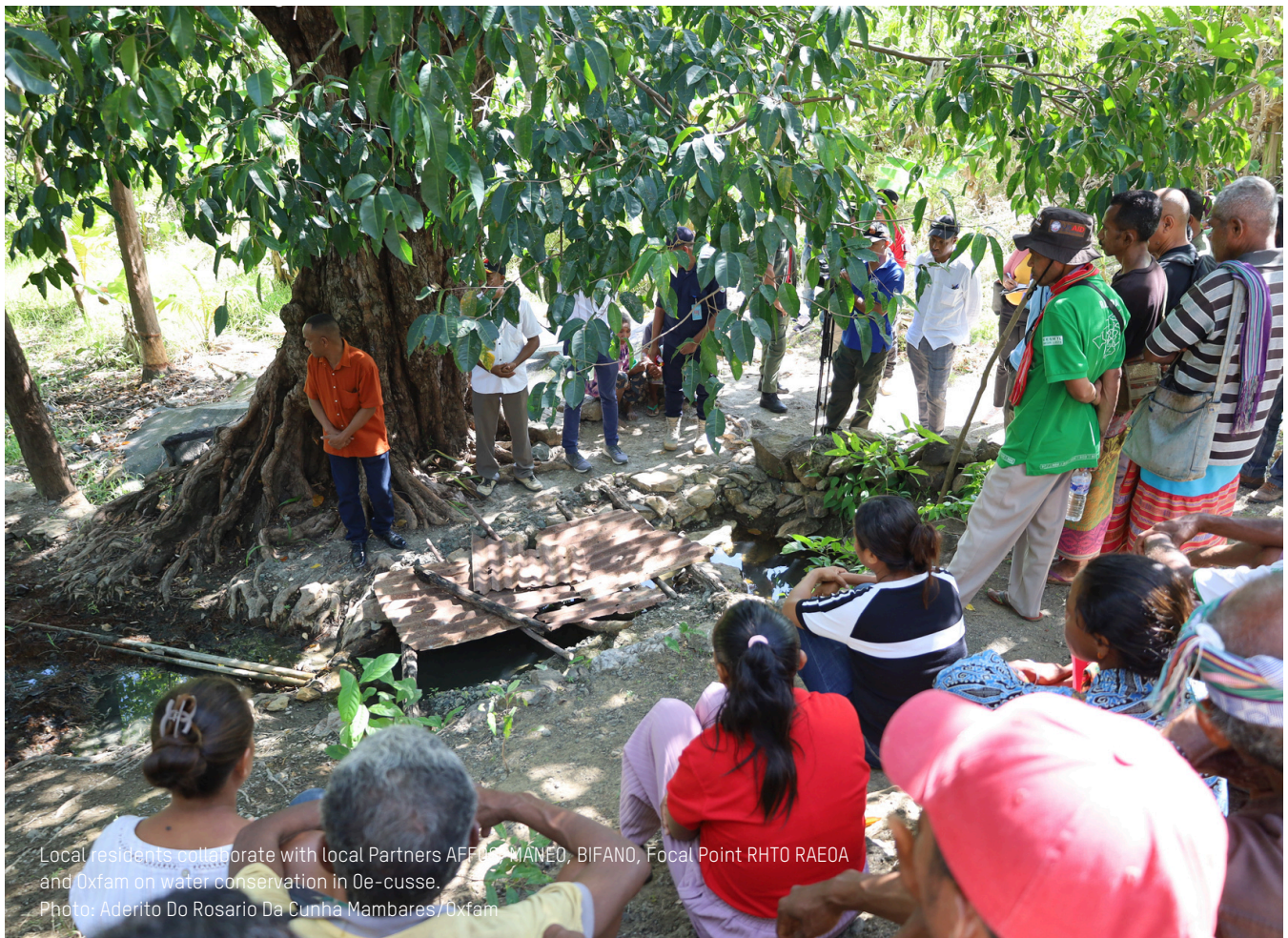
Local residents collaborate with local Partners AFFILIA, MANEO, BIFANO, Focal Point RHTO RAE0A and Oxfam on water conservation in Oe-cusse.

These visits underscored the importance of cooperation between local authorities, the community, and international organizations in implementing disaster prevention and mitigation measures to enhance the safety and well-being of the population in Oe-cusse, RAE0A. The collaborative efforts in Usi-Tasae and Naimeco highlight the significant impact of community involvement and international support in creating resilient and sustainable environments.