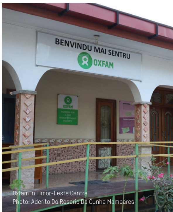
Oxfam in Timor-Leste Centre.