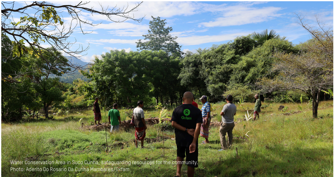
Water Conservation Area in Suco Cunha, safeguarding resources for the community.