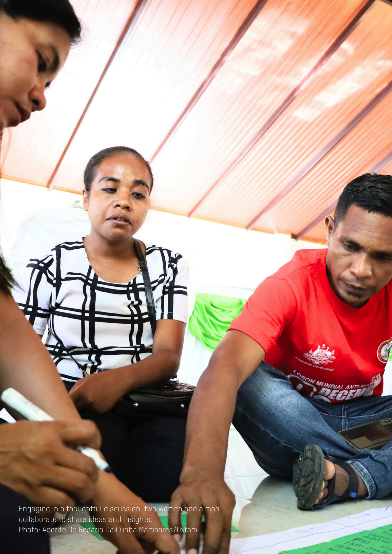
Engaging in a thoughtful discussion, two women and a man collaborate to share ideas and insights.