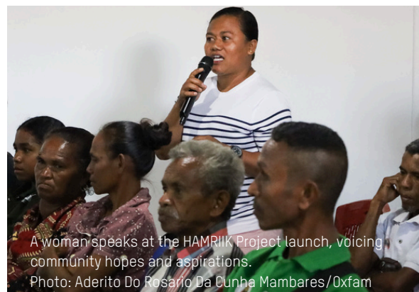
A woman speaks at the HAMRIIK Project launch, voicing community hopes and aspirations.

HAMRIIK empowers communities by promoting climate-smart agriculture, enhancing water security, and addressing gender and disability issues. With direct engagement of over 1,400 individuals and a broader impact