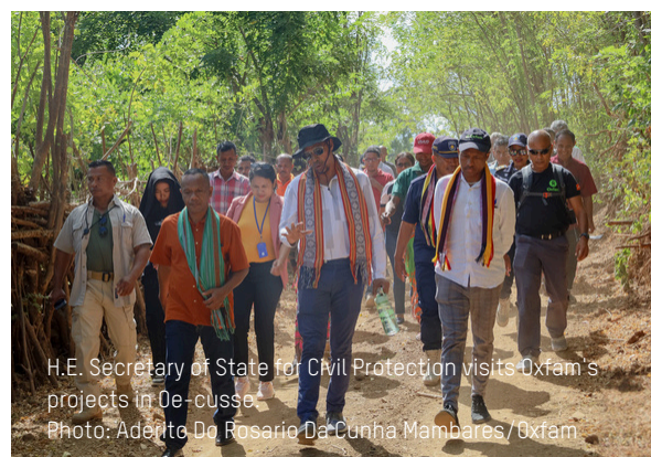
H.E. Secretary of State for Civil Protection visits Oxfam's projects in Oe-cusse.

on 7,800 people across 12 villages, this project aims to drive systemic change, foster inclusive practices, and equip decision-makers for sustainable climate adaptation.