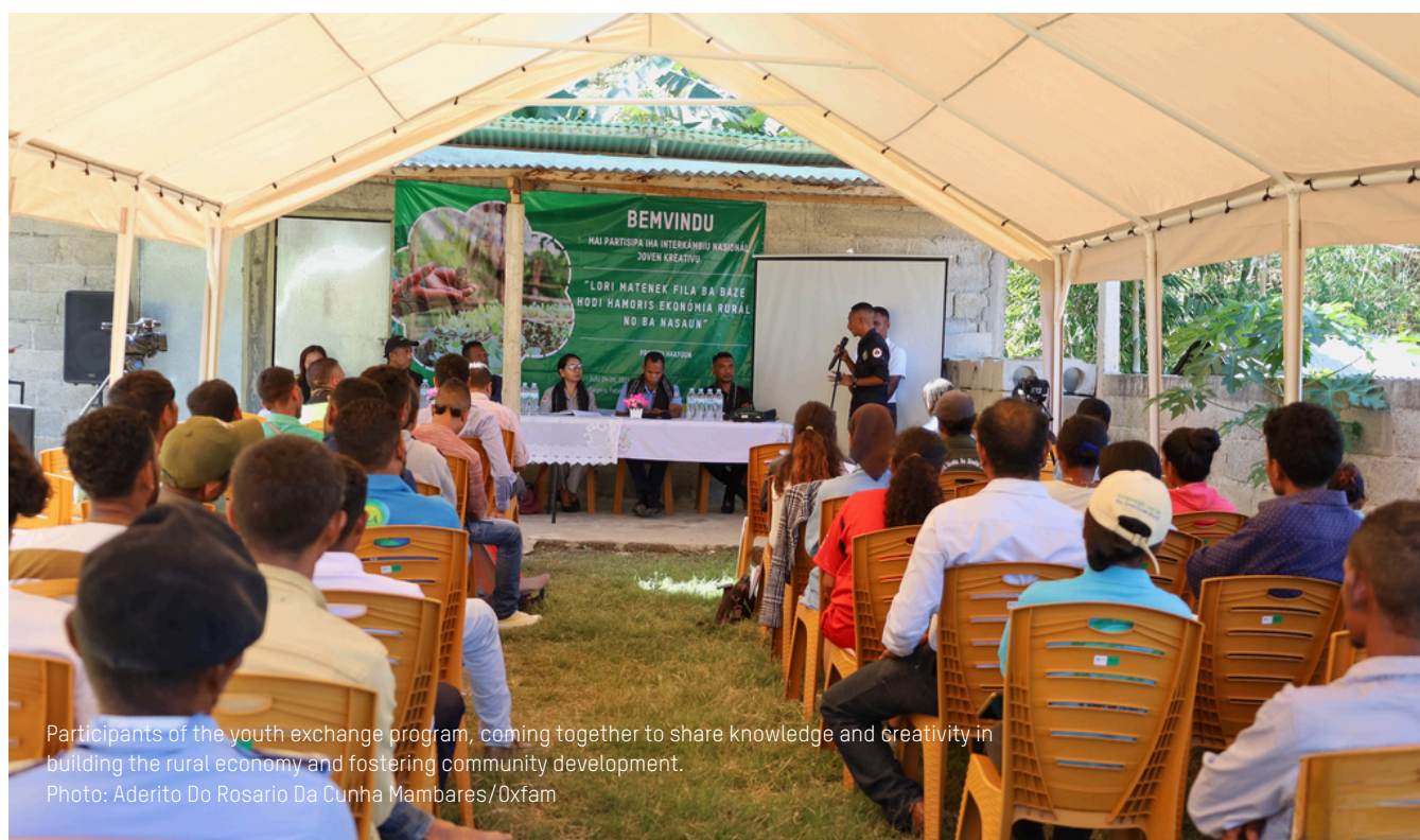
Participants of the youth exchange program, coming together to share knowledge and creativity in building the rural economy and fostering community development.

This successful program highlighted the importance of collaboration among TILOFE, EAMO, FJDE, AJTL, and Oxfam in Timor-Leste, demonstrating the power of collective effort in driving sustainable development and youth empowerment.