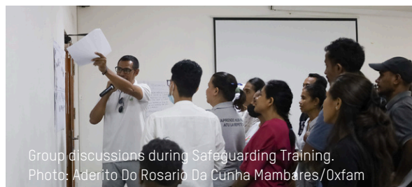
Group discussions during Safeguarding Training.

At Oxfam, we emphasize responsibility and accountability in all our endeavors. This training underscores our dedication to maintaining high