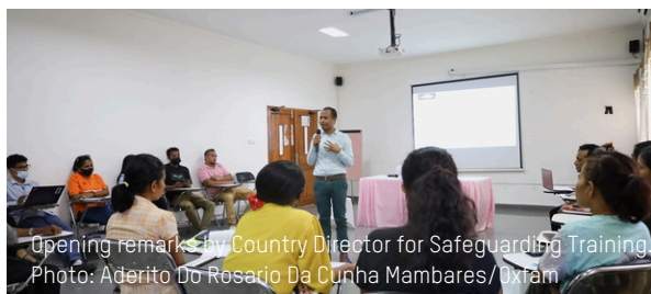
Opening remarks by Country Director for Safeguarding Training.

Oxfam in Timor-Leste, in collaboration with Forum Tau Matan, hosted a comprehensive three-month Child Protection training sessions for our program partners as well as Oxfam staffs. Moving forward, this essential training will be an annual fixture for Oxfam in Timor-Leste, ensuring that everyone involved in our programs is equipped with the knowledge and skills needed to safeguard children's well-being.