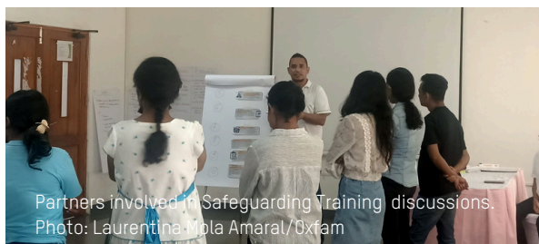
Partners involved in Safeguarding Training discussions.

In addition to the formal training sessions, participants had the opportunity to share their experiences and best practices. This peer-to-peer learning approach fostered a collaborative atmosphere where everyone could learn from each other's successes and challenges. By the end of the training, participants felt more confident and prepared to handle child protection issues within their respective organizations.