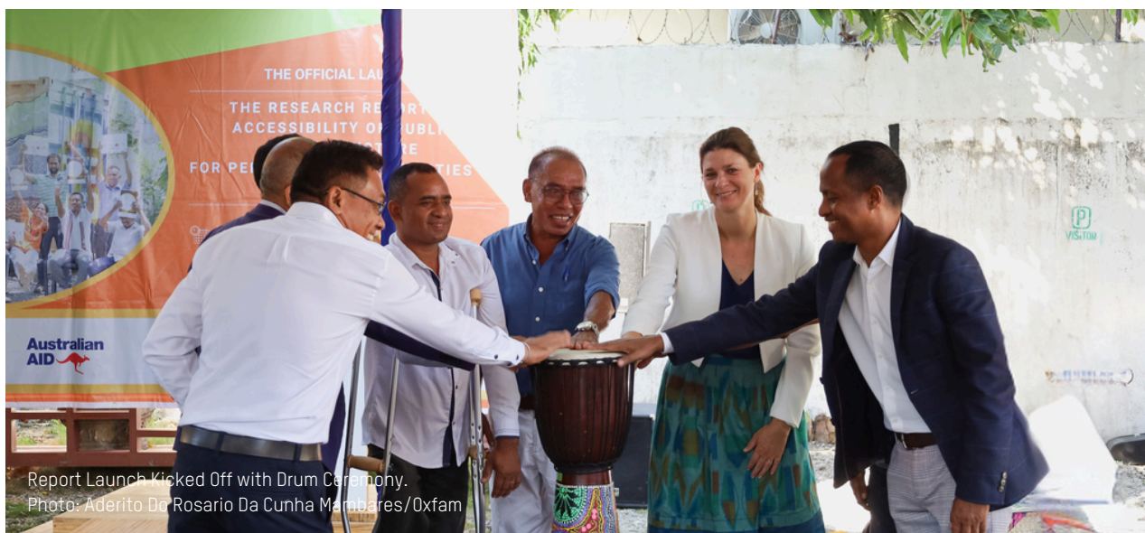
Report Launch Kicked Off with Drum Ceremony.

PwD in Timor-Leste encounter widespread prejudices, economic inequalities, obstacles to employment and education, and inadequate access to public services and infrastructure. These challenges significantly hinder their full integration into society, perpetuating systemic marginalization.