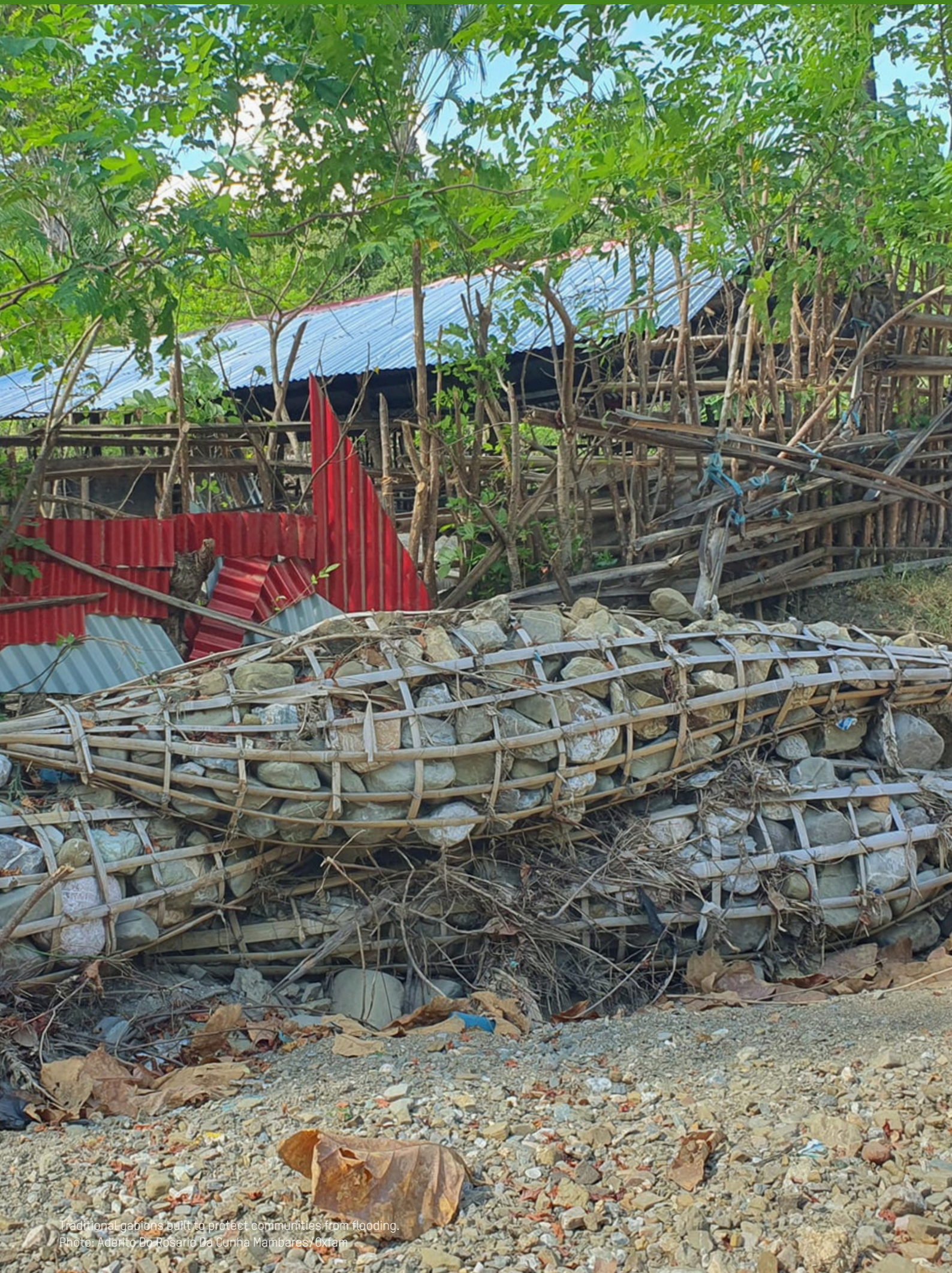
Traditional gabions built to protect communities from flooding.