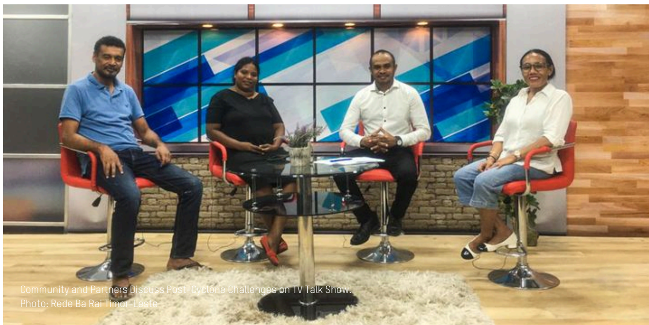
Community and Partners Discuss Post-Cyclone Challenges on TV Talk Show.

Addressing these issues requires comprehensive government policies, as emphasized in the talk. The Land and Women's Rights Project plays a crucial role in advocating for solutions to these challenges, aiming to improve the living conditions and housing security for the Hera communities.