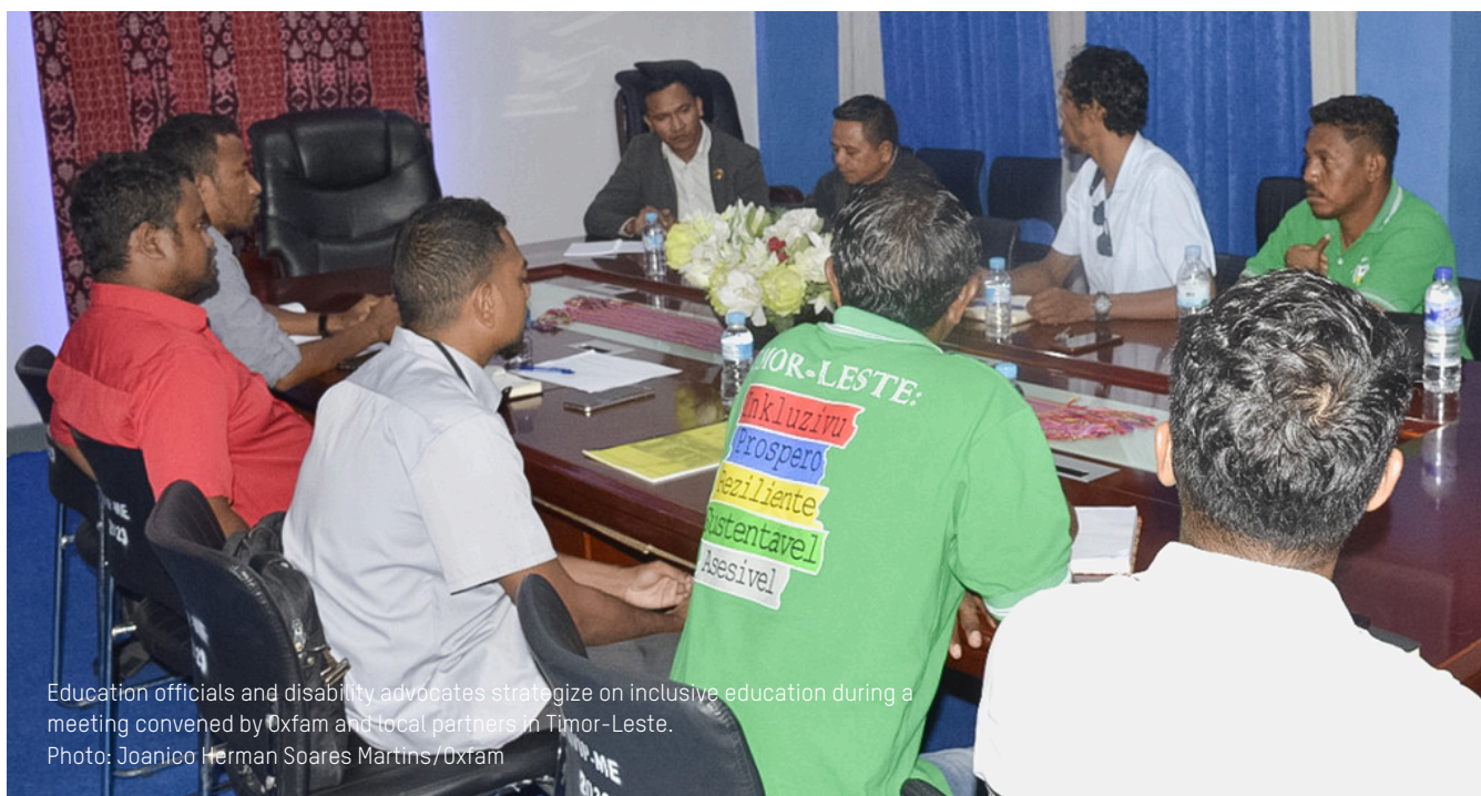
Education officials and disability advocates strategize on inclusive education during a meeting convened by Oxfam and local partners in Timor-Leste.