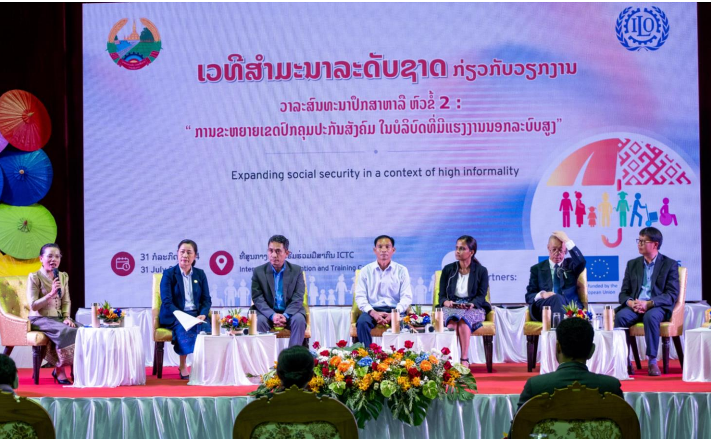
Photo: A panel discussion on expanding social security in a context of high informality at ICTC, Vientiane, Lao PDR.

On July 31, 2024, The Ministry of Labour and Social Welfare, in collaboration with the International Labour Organization (ILO), proudly announces the first-ever National Social Protection Symposium. This landmark event gathers key stakeholders and development partners from both local and international levels to address the theme: "Protecting Informal Workers and Rural Dwellers under the National Social Protection Strategy" .