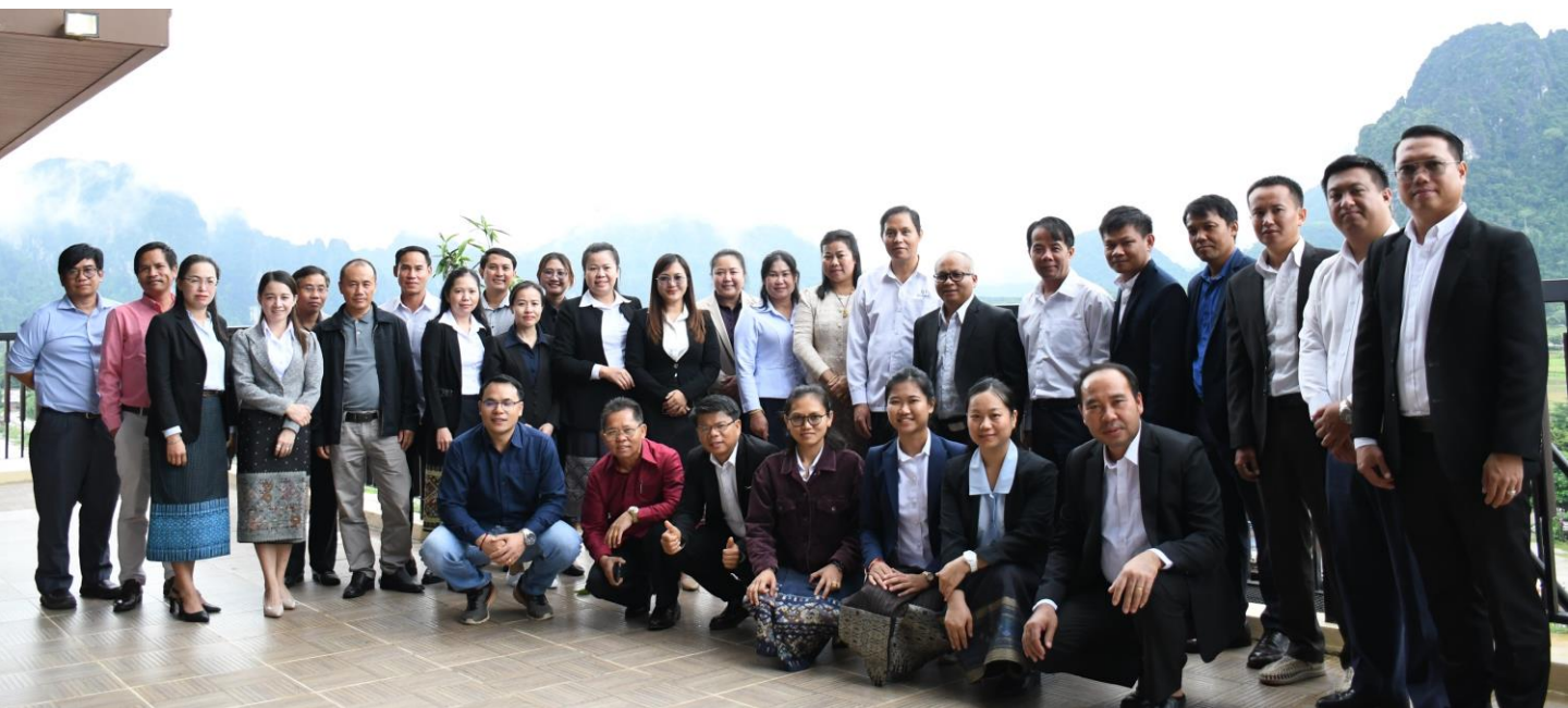
Photo: A group photo on National Consultation Workshop in Vangvieng, Lao PDR.

The increase in population and economic growth has all led to an increase in energy consumption as well. Most of the sources of energy production in the world are from fossil energy, which is the energy that releases greenhouse gases into the atmosphere and is the main cause of climate change.