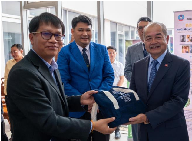
Photo: Oxfam is giving a bag to the Vice Minister at the National Social Protection Symposium.

The symposium reflects on the National Social Protection Strategy, which was first adopted in 2020 with the guiding principle of leaving no one behind through the three main pillars of Health Insurance, Social Security, and Social Welfare.