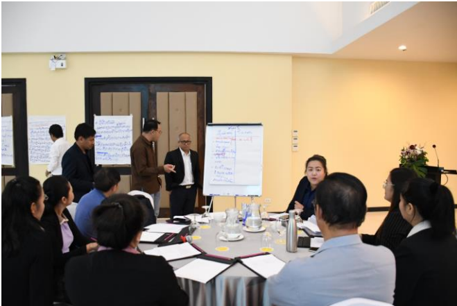
Photo: The participants are brainstorming into the Group work

Throughout supporting by DFAT, Oxfam in Lao PDR is taking the initiative to define a 5-year action plan with partners from the Ministry of Energy and Mines (MEM) and CSO partners in the scope of gender-related energy transition work in the country.