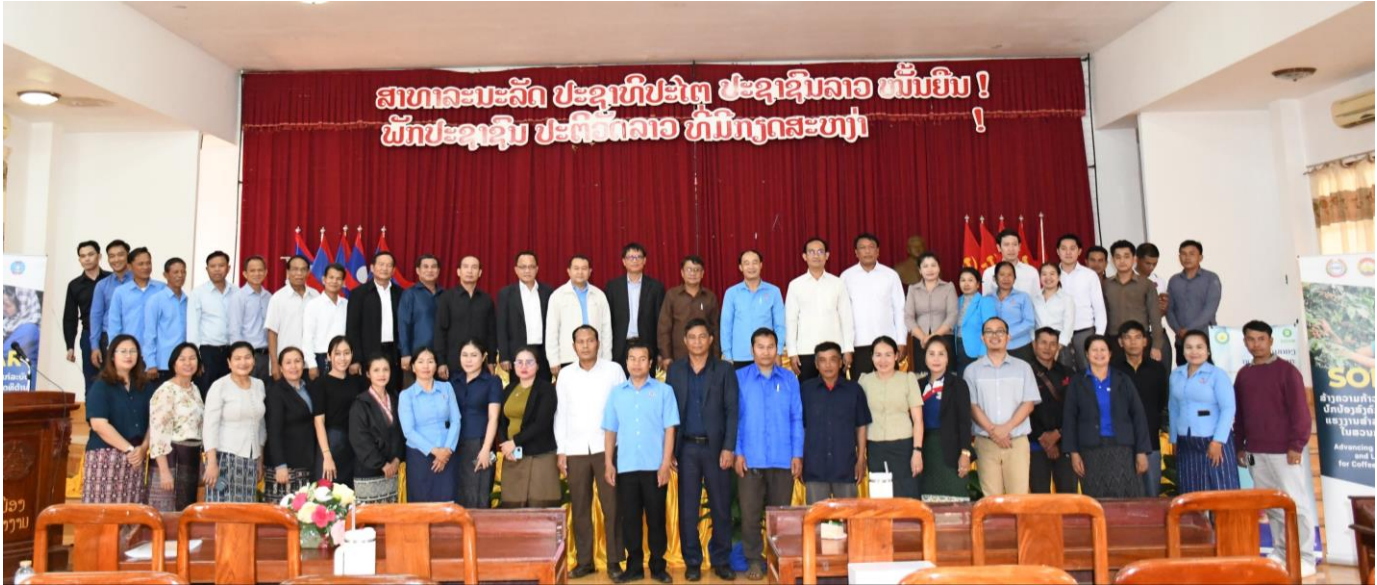
Photo: A group photo on the SOLAR project closing in Salavan Province.

To enhance the living conditions of coffee and tea farmers in the southern region of Laos, where the majority still lack access to Social Protection and Occupational Safe and Health (OSH). Therefore, Oxfam, ILO, CSO and partners have implemented an EU funded project on Advancing Social Projection and Labor Rights and Entitlements in the coffee and tea sectors (SOLAR 2022-2024) in three southern provinces, namely Champasak, Salavan, and Sekong. This program has significantly contributed to the National Social Protection Strategy (NSPS), especially on extending coverage of social security to small scale farmers, promote safe working environments, and decent work for all.