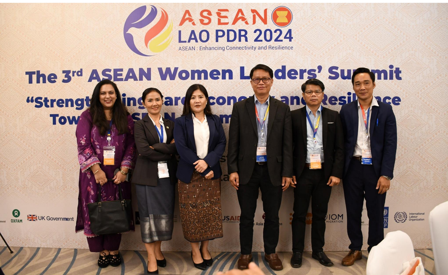
Photo: Group photo of Oxfam team on The Pre-Submit in Vientiane Capital, Lao PDR.

Oxfam is participating in the ASEAN Women Leaders pre-summit in Vientiane, Lao PDR, focusing on "Strengthening Care Economy and Resilience Towards ASEAN Community Post-2025." We are grateful for our continued partnership with The ASEAN Secretariat Lao Women's Union and United Nations ESCAP to drive regional efforts on promoting a care economy , building on last year's Regional Forum on Care in ASEAN. We're highlighting progress on unpaid care work, best practices, and the critical connection between care and climate . Our joint efforts aim to drive increased investment in care services and infrastructure, and the adoption of care-responsive policies across ASEAN. Together, we're working towards a future where care work is recognised as the foundation of resilient communities and a thriving ASEAN.