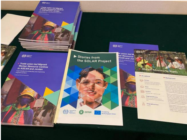
Photo: Oxfam’s Comms material is displaying in the workshop

Oxfam has shared the importance of social protection for migrant workers, including health care, work injury benefits, and sickness benefits for migrant workers. Emphasize the implementation of the ASEAN declaration on the portability of social security benefits for migrant workers, and leveraging bilateral and multilateral agreements to ensure equality of treatment of nationals and non-nationals regarding coverage and entitlement to benefits in the destination country.