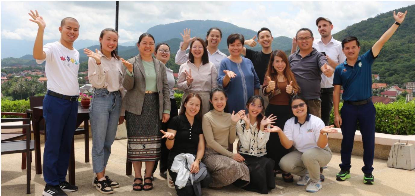
Photo: A group photo on Project Journey Write-Shop in Luangprabang.

From 2-4 July 2024 in Luang Prabang, Voice in Laos facilitated a Project Journey Write-Shop which was attended by grantee representatives that their projects were implemented completely including: People with Disabilities Development Association, Bamboo and NTFP Development Association, Namjai Community Association, Takienglaos, Xonphao, Dakdae, IWWA, DSDT and WECARE.