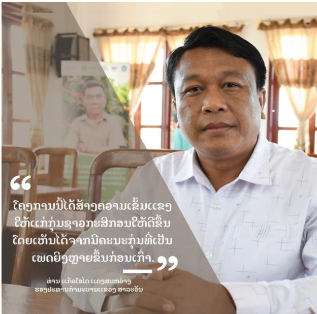
Photo: A quote from Implementation Management Committee (IMC) in Salavan province.