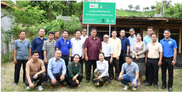
Photo: Group photo in front of the livelihood site in Pak-Ou district, LPB.

also played a greater role in decision-making, which saw an increase in income from the original about 15–18 million kip/year.