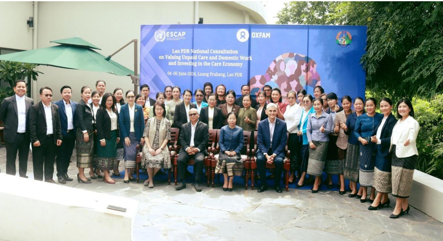
Photo: Group photo on National Consultation Workshop in Luangprabang, Lao PDR.