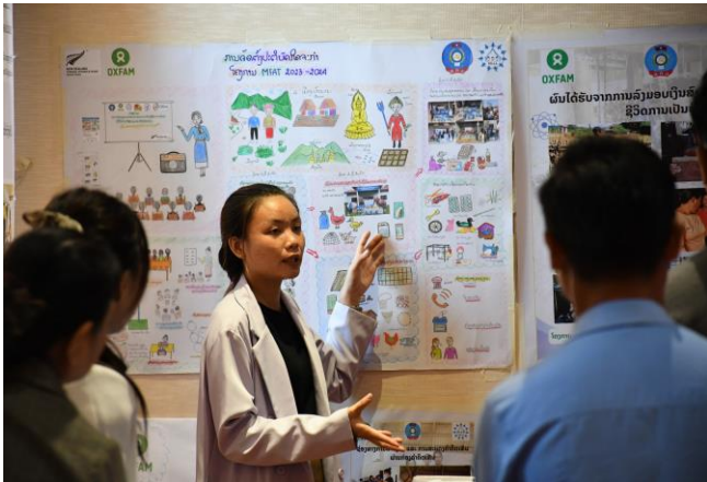
Photo: The facilitator is explaining how the project works to the audiences.