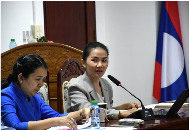
Photo: A program lead is presenting of project’s achievement since implementing until the end of period.

Throughout the discussion at the meeting, the participants expressed their opinions, pointed out the positive and weak points, and suggested ways to improve the draft report on the implementation of the project to support Essential Necessary and Livelihoods Support to Vulnerable Communities Affected by the COVID-19 Pandemic in Lao PDR.