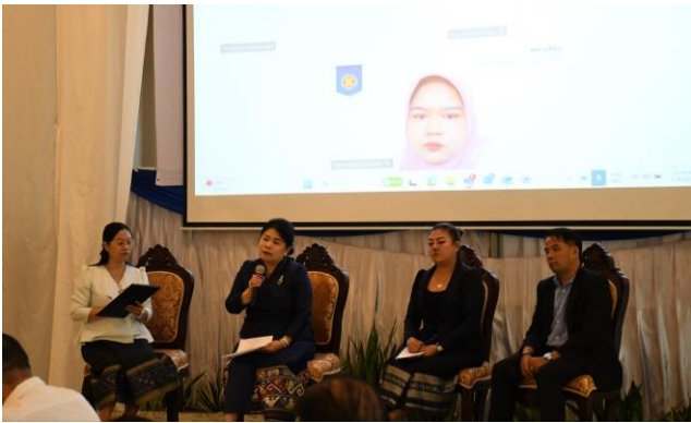
Photo: A panel discussion on Promoting Gender in Just Energy Transition.