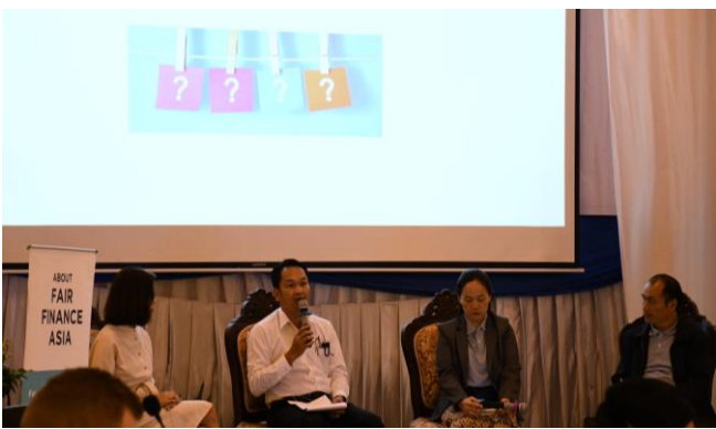
Photo: A panel discussion on Fair Finance in Laos.