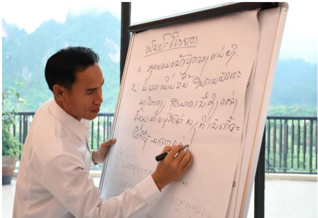
Photo: A group representative is writing benefit on gender in energy transition in Laos.

In addition, this meeting is also a forum to discuss the situation of energy transition in Laos and set guidelines together with relevant parties in order to prepare information to support the ASEAN meeting with an agenda on energy transition and gender roles in 2024 that Lao PDR will host.