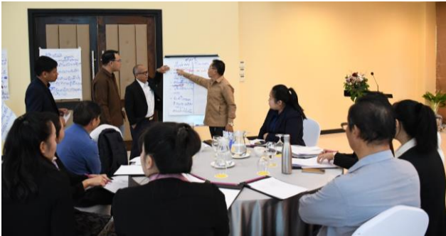
Photo: A group discussion and planning on Energy Transition in Laos.

Throughout discussion on the meeting day, it was one of the agenda to learn the direction of energy transition to clean energy that is friendly to the environment and safe. At the same time, the transition will also provide opportunities for women to actively participate to ensure that the transition is not only sustainable but also equitable and inclusive.