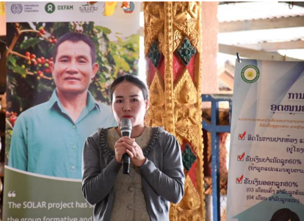
Photo: A group representative is presenting about the achievement and challenges.

In addition, implementing partners also present their achievements, share their opinions, and point out the challenges and issues related to the implementation of this project.