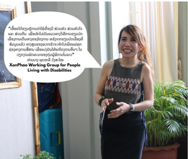
Photo: A voice from Xonphao’s director.

This narrative format captures significant highlights, key experiences, outstanding outcomes, and changes as well as voice and stories of the rightsholders throughout their Voice Project's implementation.