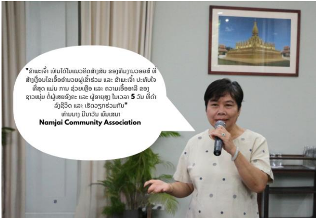
Photo: A voice of representative from NCA.