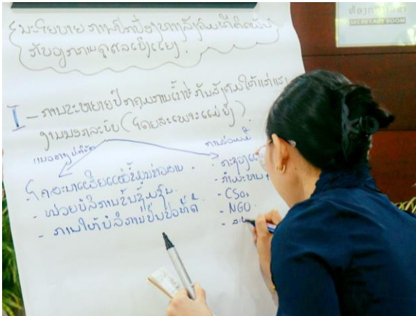
Photo: Participant is sharing in Group work