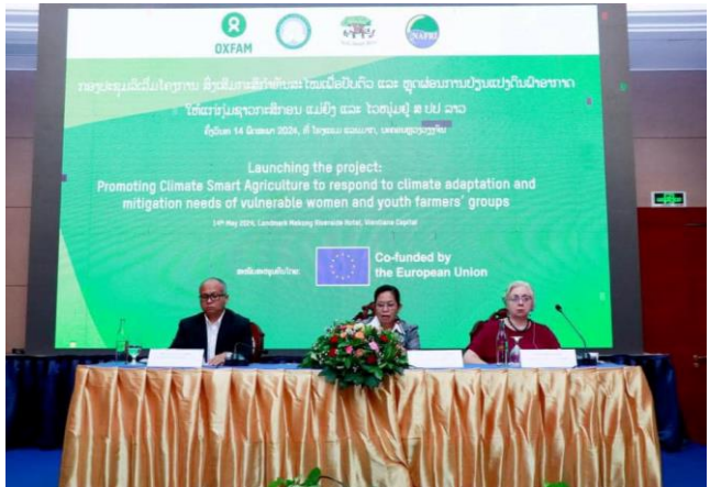
Photo: The chairman is giving a speech at the meeting.

The project will be implemented in 15 villages in seven districts of which three districts, Xepon, Vilabouly and Champhone are in Savannakhet province and four districts, Xiengngeun, Nan, Chomphet and Phoukhoun are in Luangprabang province.