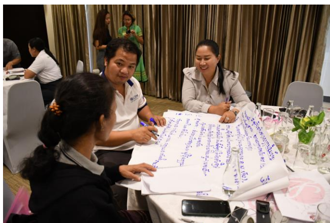
Photo: Trainees are discussing their group work

This training exchanged on the skills and knowledge of collective bargaining informal economic sectors, role-playing exercises, and the joint development of collective bargaining plan for informal workers.