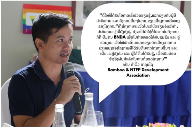
Photo: A voice of representative from Bamboo & NTFP.