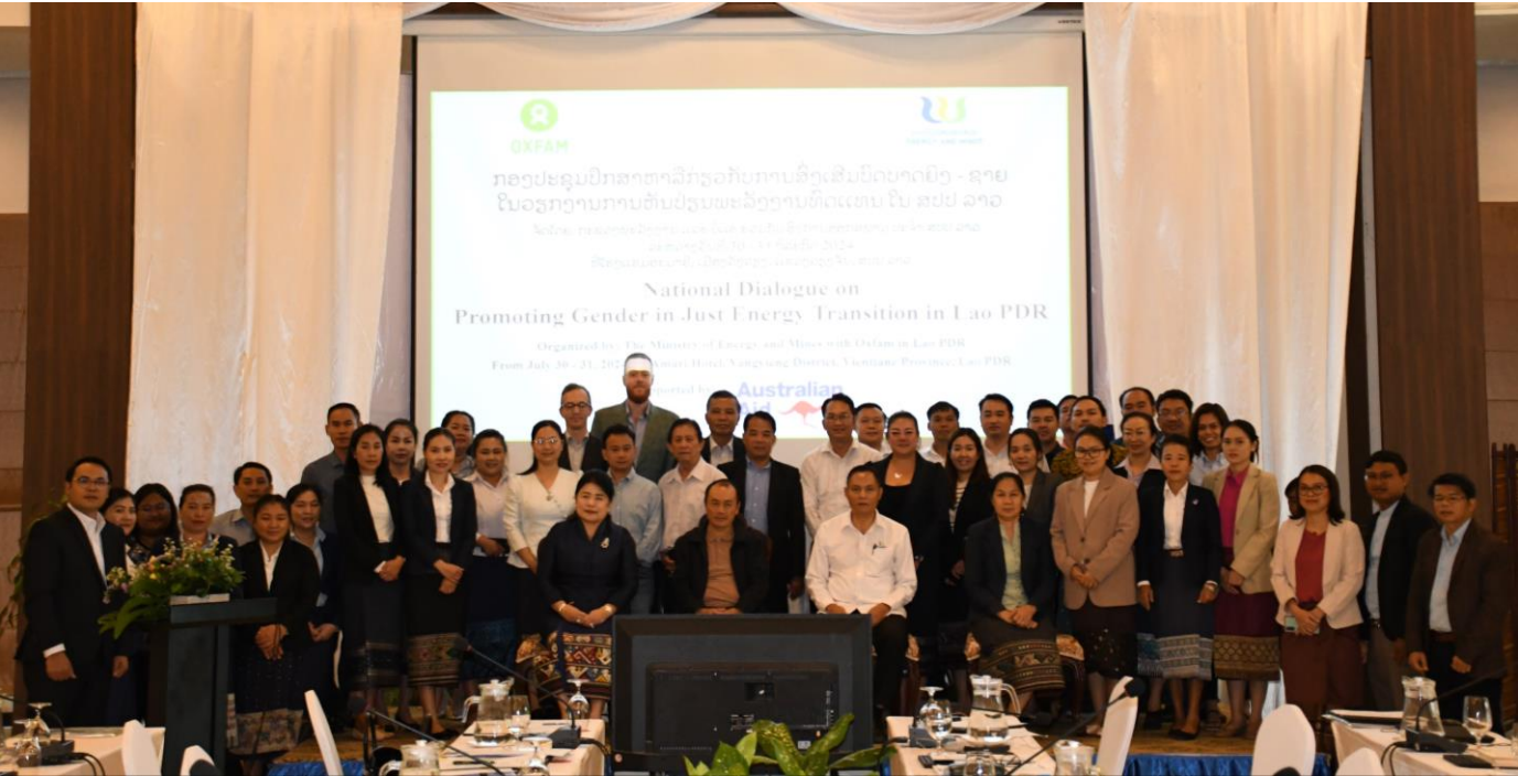
Photo: A group on the National Dialogue on Promoting Gender in Just Energy Transition in Lao PDR.

Last week, Oxfam in Lao PDR together with the Department of Energy Efficiency and Promotion, Ministry of Energy and Mines (MEM) held a National Dialogue on Promoting Gender in Just Energy Transition in Lao PDR, from July 30 –31, 2024 in Vangvieng, Lao PDR.