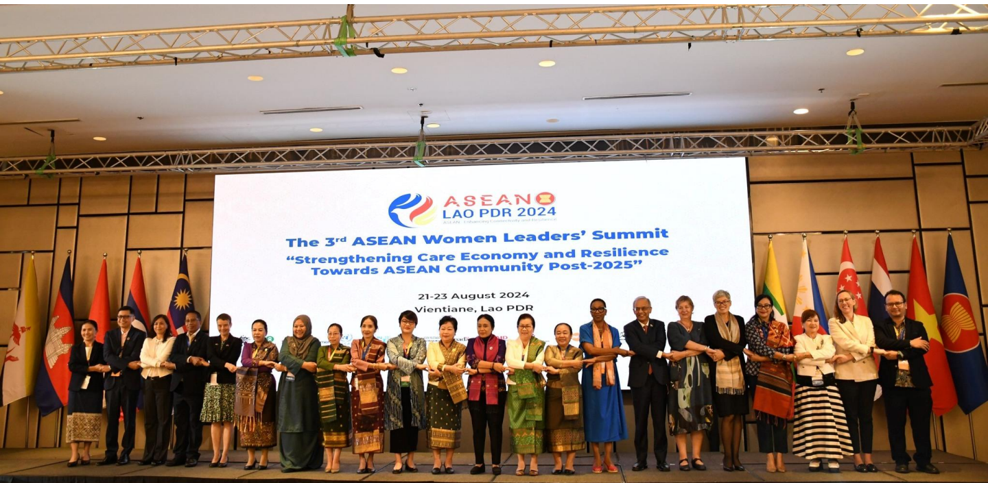
Photo: Group photo on The Pre-Summit in Vientiane Capital, Lao PDR.