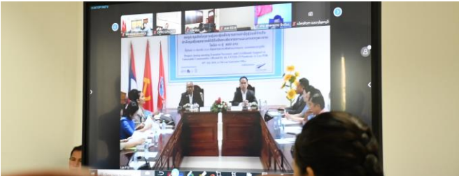
Photo: Participants are joining via online.

artment of Labor Protection, Lao Federation and Tread Union (LFTU), organized a project closing meeting on Essential Necessary and Livelihoods Support to Vulnerable Communities Affected by the COVID-19 Pandemic in Lao PDR on July 5, 2024, at the Lao Federation’s Office, Vientiane, with all related partners participating both in person and online.