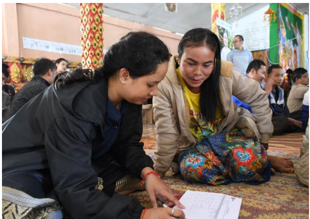
Photo: Oxfam’s staff is explaining to the villager.

On July 26, 2024, Oxfam in Laos , together with the Department of Labor Protection, the Lao Federation and Trade Unions (LFTU), and civil society partners, held a meeting to close the project in Lao Ngarm District, Saravan Province. The project’s closing summarized the results through the implementation of the project and evaluated the success of the project, as well as exchanged comments from the relevant parties.