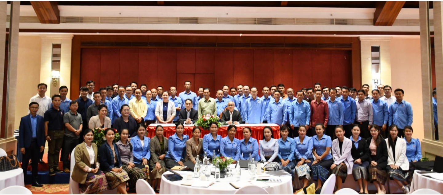
Photo: Group photo on meeting coordinator and progress reports in Vientiane Capital, Lao PDR.

Between June 11-13, 2024, Oxfam Lao PDR's the provide essential livelihoods support vulnerable communities affected by the COVID-19 pandemic Project, under the financial support of the Ministry of Foreign Affairs and Trade of New Zealand together with the Department of Labor Protection, the Lao Federation of Trade Unions (LFTU) held a meeting on the coordinators, reporting progress, sharing lessons learned and implementation plans for projects to provide essential livelihoods support vulnerable communities affected by the COVID-19 pandemic throughout the 1 past year in Vientiane Capital. The previous implementation has seen positives results and is visible to the society by distributing food storage equipment, hygiene equipment and some funds to the project's target