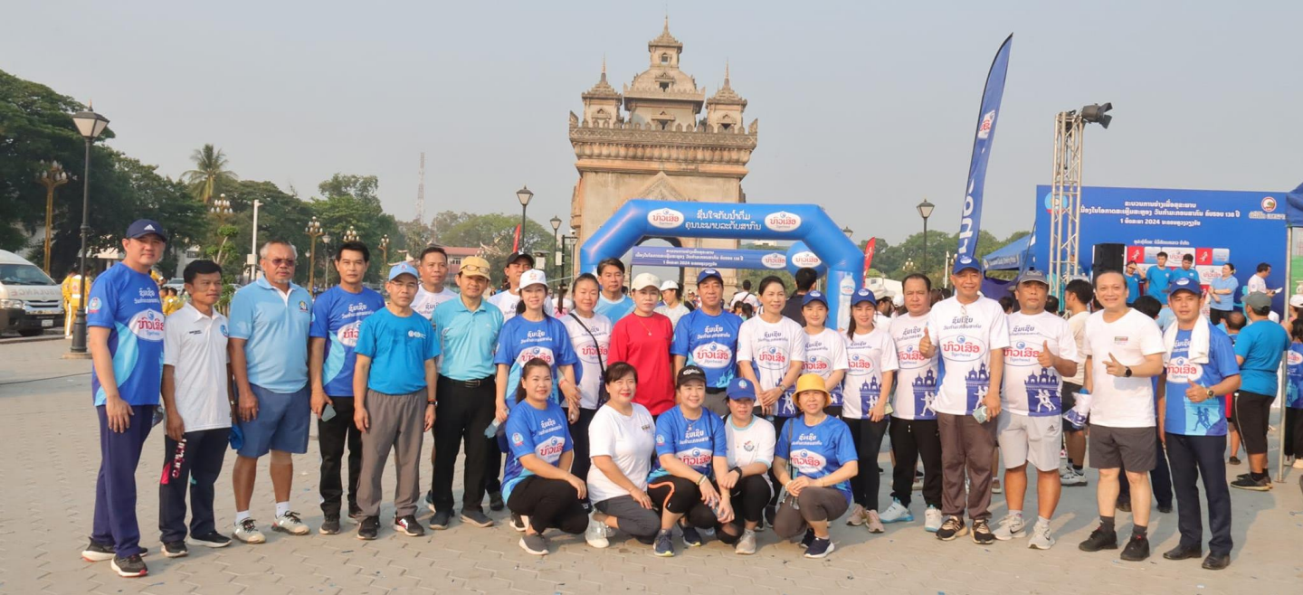
Photo: A group photo celebrates International Labor Day in Vientiane Capital, Lao PDR.

On May 1st, 2024, Oxfam in Laos, along with our partners, proudly participated in a mini-marathon organized by the Lao Federation of Trade Unions to celebrate International Labour Day. This significant event brought together approximately 8,000 participants from various working sectors across Laos, united in their gratitude for the vital contributions of workers both within the country and worldwide.