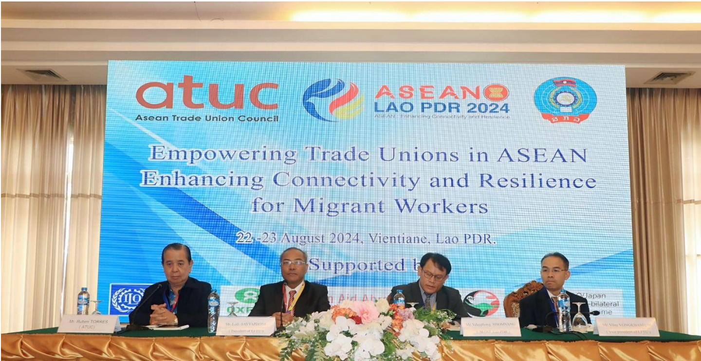
Photo: A group of Chairman on a workshop “Empowering Trade Unions in ASEAN Enhancing Connectivity and Resilience for Migrant Workers” .

Marginalize workers, especially migrant workers often face numerous challenges, including exploitation, lack of legal protection, and limited access to essential services. The COVID-19 pandemic and recent regional conflicts have further exacerbated their vulnerabilities, highlighting the urgent need for coordinated action to protect their rights and well-being. So, a workshop on Empowering Trade Unions in ASEAN Enhancing Connectivity and Resilience for Migrant Workers took place on 22-23 August 2024, Vientiane, Lao PDR.