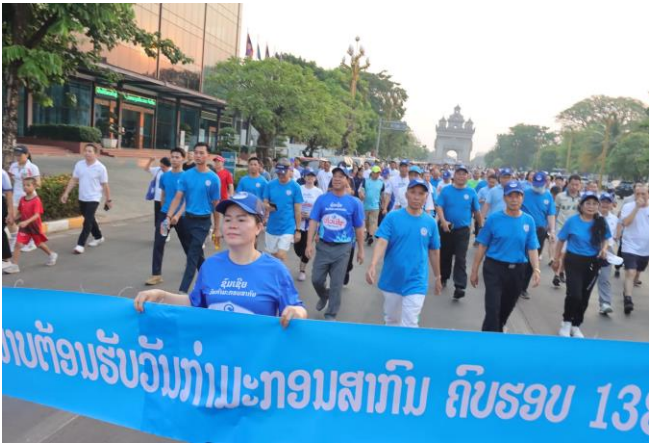
Photo: A parade is walking on Lanxang.avenue, VTE.

Saffron Coffee Company exemplifies outstanding compliance with labor laws and international standards. Their internal regulations include health insurance, overtime compensation, holidays, and a strong non-discrimination policy. These policies ensure that their staff work in a safe environment and are treated fairly, setting a high standard in agri-food sector.