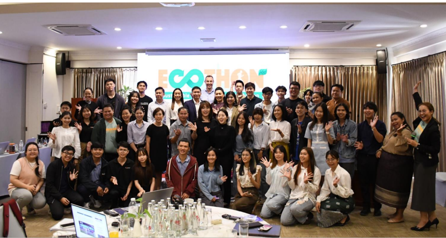
Photo: A group of Participants participate the 2024 Ecothon in Vientiane Capital, Lao PDR