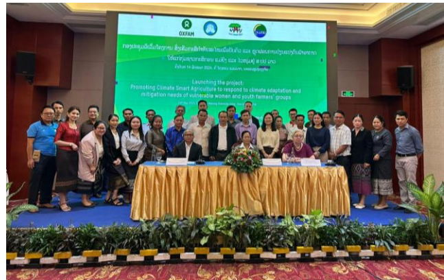
Photo: Group photo on MOU signing ceremony of CSA Project in Vientiane, Lao PDR.

The project is expected to directly benefit a total of 300,000 farming families and 100,000 other people, especially through the provision of techniques, knowledge and skills related to Climate Smart Agriculture (CSA). It is also expected to improve yields.