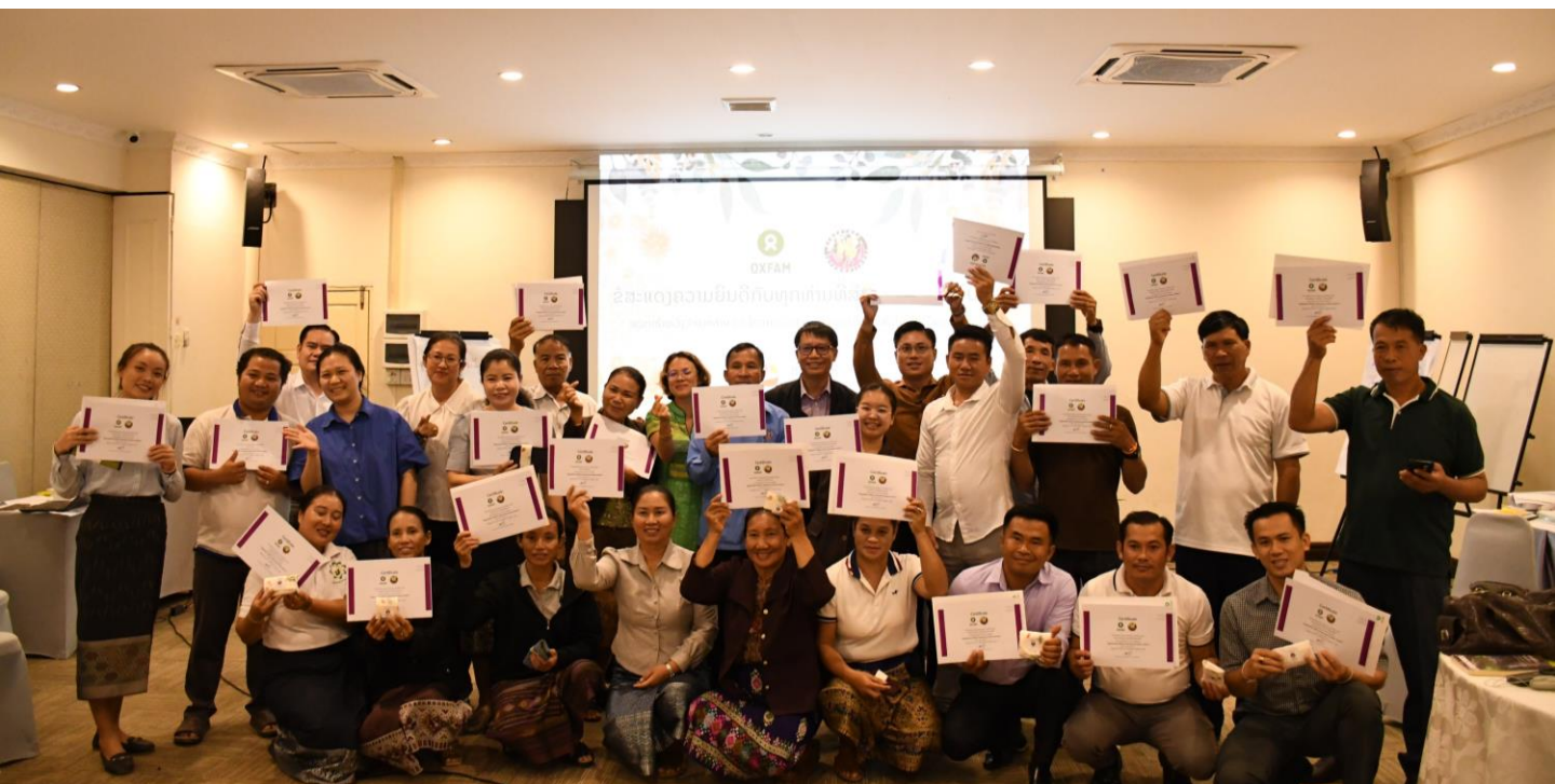
Photo: A group of Trainees are raising their certified certificate after completed the training workshop