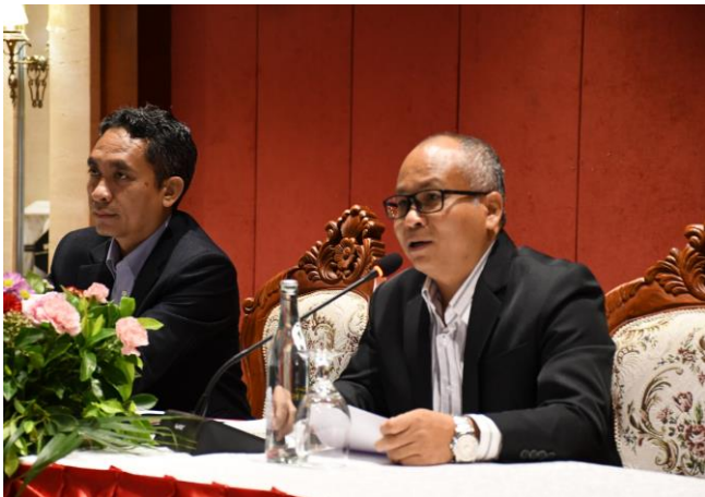
Photo: The chairman is giving a speech at the meeting.

The purpose of this meeting is to summarize the results of project's implementation and lesson learned, progress and challenges in the past year.