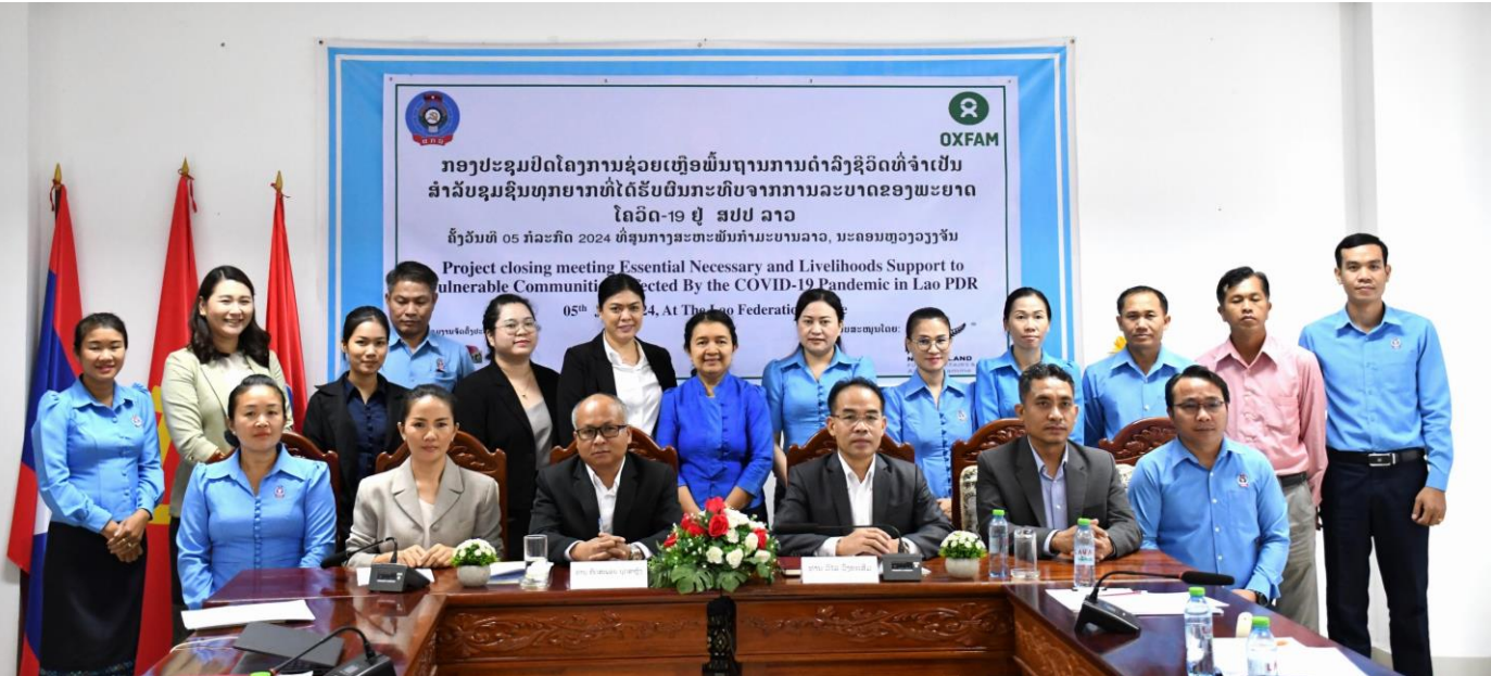
Photo: A group photo on project closing meeting at Lao Federation’s Officer in Vientiane.

During the outbreak of COVID-19, communities throughout the country have been affected, especially the farming communities living in rural areas, which have been affected both economically and socially. Therefore, Oxfam in Lao PDR together with the Dep-