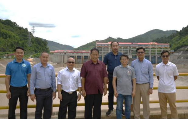
Photo: Group photo in front of Pak-Ou's Dam, LPB.

From June 13–15, 2024, the Oxfam team, in cooperation with the Department of Natural Resources and Environment of Luangprabang province, the Office of Natural Resources and Environment of Pak-Ou district, the Lao Youth Union, the Lao Women’s Union, and the Office of Agriculture of Pak-Ou district, joined together to follow up and site visit the farmers who received funding to raise livestock in Pak-Ou district, Luangprabang province.