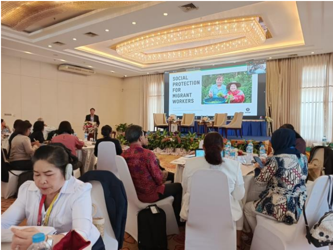
Photo: Oxfam is presenting the importance of Social protection

Marginalize workers, especially migrant workers often face numerous challenges, including exploitation, lack of legal protection, and limited access to essential services. The COVID-19 pandemic and recent regional conflicts have further exacerbated their vulnerabilities, highlighting the urgent need for coordinated action to protect their rights and well-being. So, a workshop on Empowering Trade Unions in ASEAN Enhancing Connectivity and Resilience for Migrant Workers took place on 22-23 August 2024, Vientiane, Lao PDR.