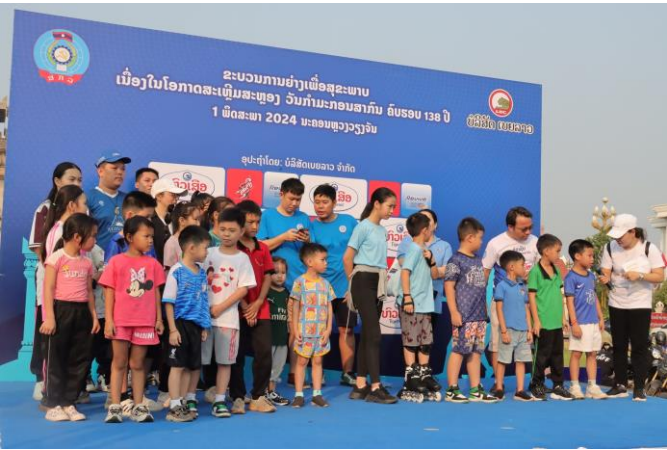
Photo: A group photo in front of the main backdrop.

In alignment with our mission, Oxfam in Laos has produced a guide titled "Leading by Example: Good Practices for Labour Law Compliance and Workplace Safety," featuring Saffron Coffee Company in Luang Prabang. This guide showcases admirable labor practices and serves as an inspiration for other employers to understand the significance of adhering to labor laws, creating a fair environment for all workers.